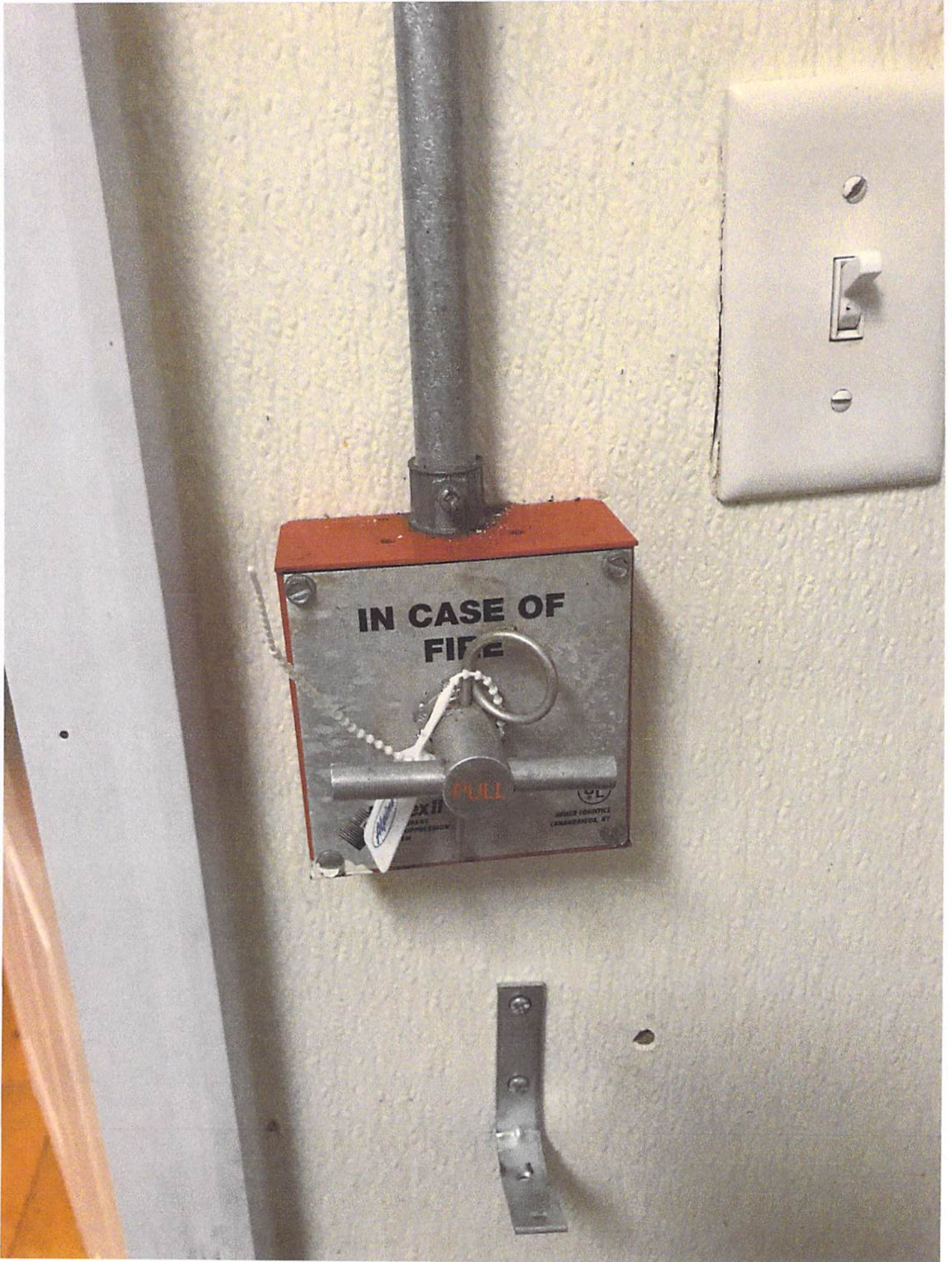
Hamburguesas key door