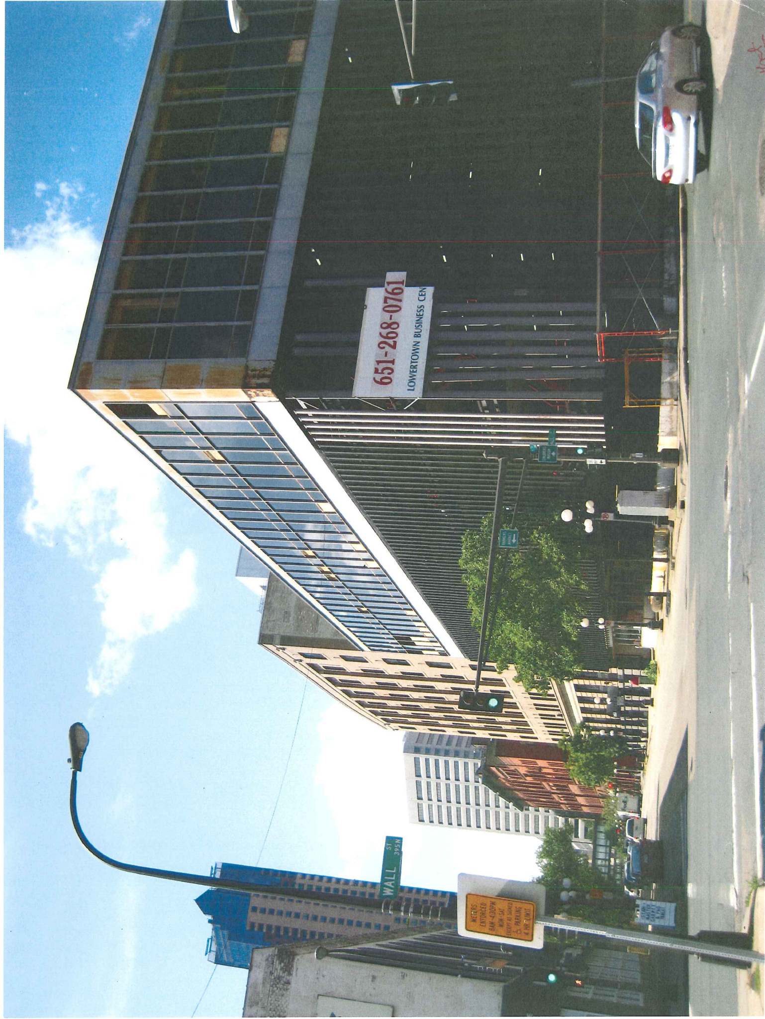
During painting phase - shows signs removed