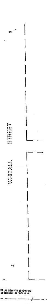
VICINITY MAP SHEET NO. 1, 2, 3, 4, 5, 6, 7, 8, 9

THE TOTAL USE OF THIS DRAWING QUANTITY OF COPIES IS LIMITED TO THE QUANTITY OF COPIES WHICH IS LISTED TO HAVE A READING OF 600/16/16/16/16. LEGEND O Denotes 1/2 inch x 18 inch iron pipe set marked by license no. 18425 e Denotes hand 1/2 inch iron monument, unless otherwise shown (A) Denotes measured Distances (P) Denotes Plot Distances