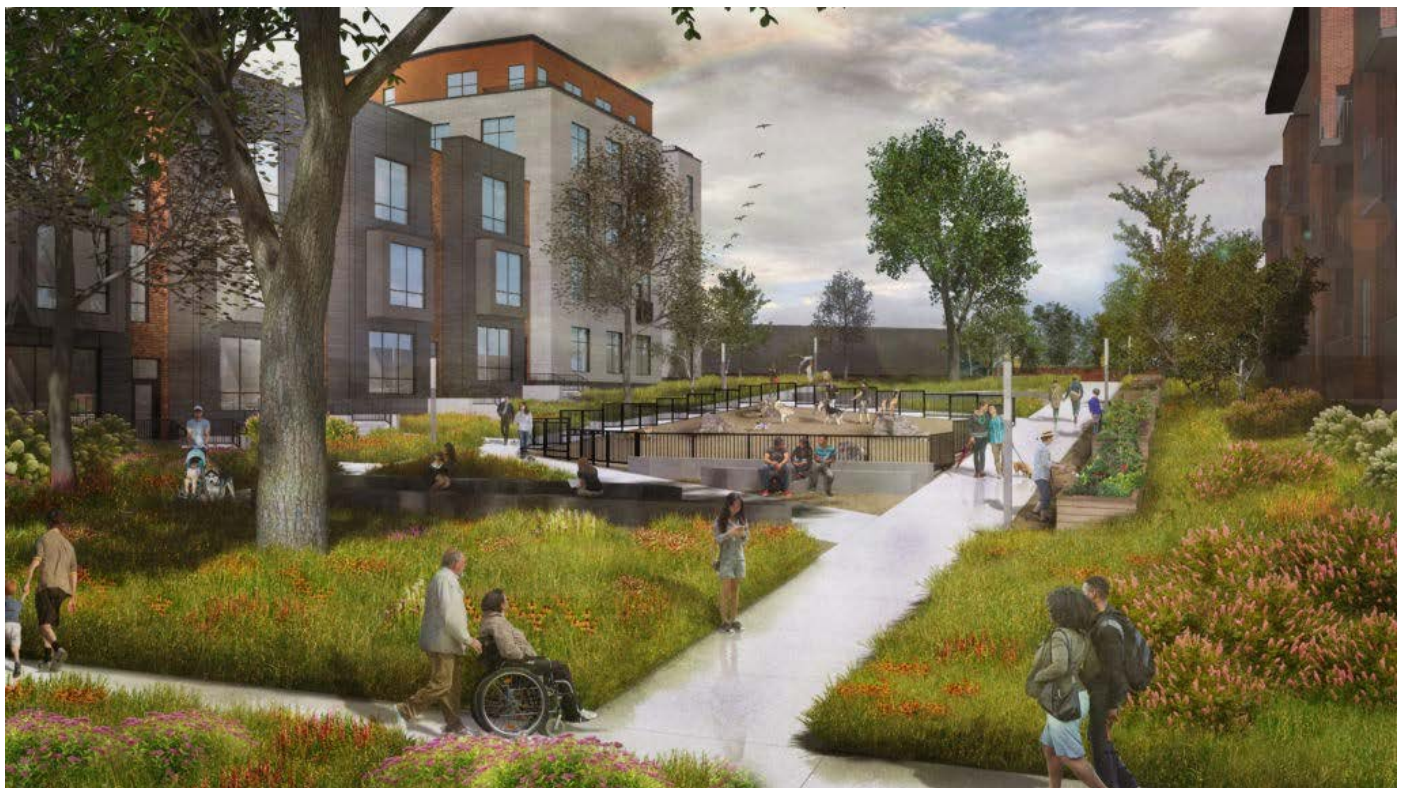
In keeping with the proposed Hillcrest Master Plan, this rendering shows how passive green spaces could fit between residential areas to enhance community connections.

Converting a commercial golf course into a publicly managed green space is not feasible from a budgetary standpoint. The city's parks department has neither the capacity nor the resources to manage more than a five-acre active park. In addition, the financial impact to maintain more than that would put a significant burden on residential taxpayers. With that said, the Port Authority will work with the community to maximize the potential of an additional 15-acres of publicly accessible green space as previously agreed upon.