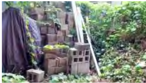
Lower back corner of property before excavating

After I removed the garbage I used the area for storing lumber and landscape blocks I intended to use at a later time.