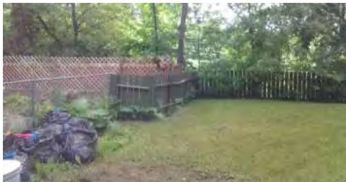
As seen from my only neighbor's back yard

My only neighbor is Sandy Rice who resides at 1430 Westminster St. She is a good friend of mine and has stated she has no objection of me having such a storage unit in my backyard.