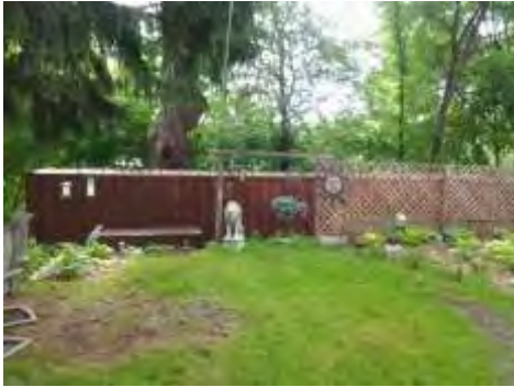
The storage unit seen from my back yard

Since the storage unit is just over 8 feet tall...a major portion of it appears to be below ground.