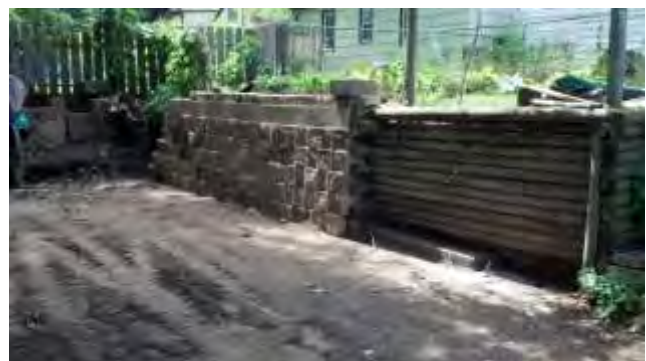
The nearly complete wall after clearing away ground

Behind these foundation blocks I dug a channel for installing a new drain tile system and then built a retaining wall that is roughly 5.5 feet tall and over 30 feet long.