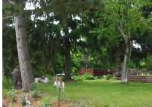
My back yard as seen from someone walking along sidewalk

Furthermore, my home sits on a double-wide lot (high taxes paid). It is also a corner lot with a wooded backyard backing up against a city owned watershed.