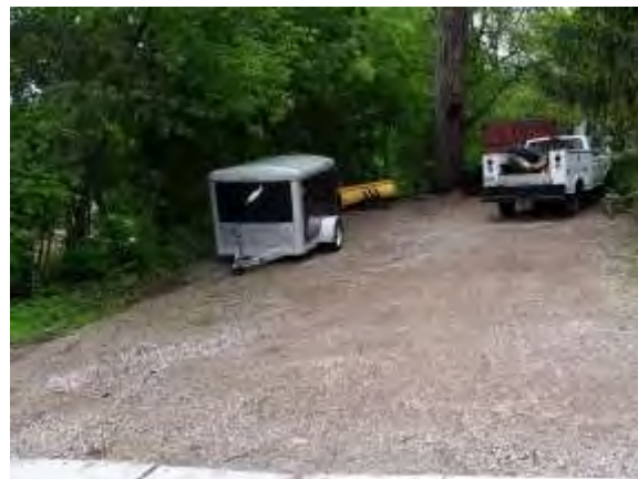
The lower level parking area as seen by someone walking on sidewalk along Arlington Ave.

To enhance the look of the property I have added over 32 tons of gravel to the driveway.