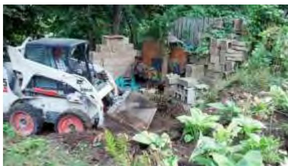
Removing the ground from the slab area

Since discovering the slab I have finished removing the soil that covered it and also found a row of foundation blocks.