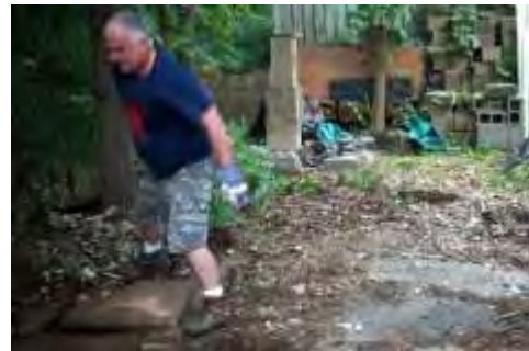
Uncovering the cement slab

Last Fall I started to plan how I could use this corner of my property for some type of a storage unit. Upon excavating this area I discovered there was an existing concrete slab underneath it. Apparently, some years ago there was where a garage built on it.