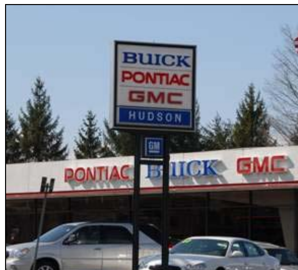
Repetitive signs like these are unnecessary and clutter our communities.

But good design includes more than just the sign's physical characteristics; good sign design also relates to the placement of the sign in the landscape. Signs that are placed