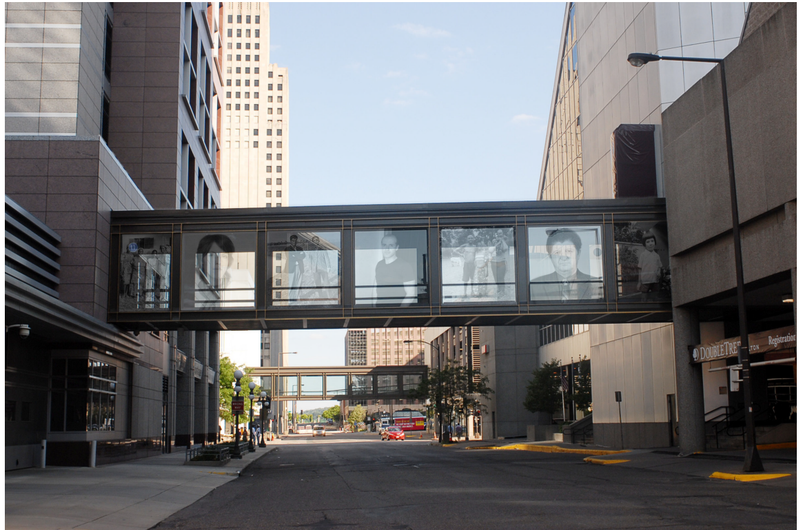
Example rendering of proposed exterior view