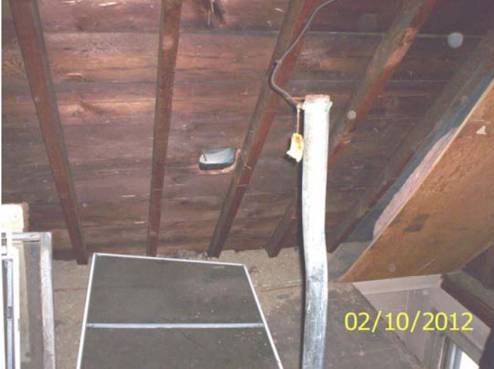
Open plumbing vent

HP District: Property Name: Survey Info: