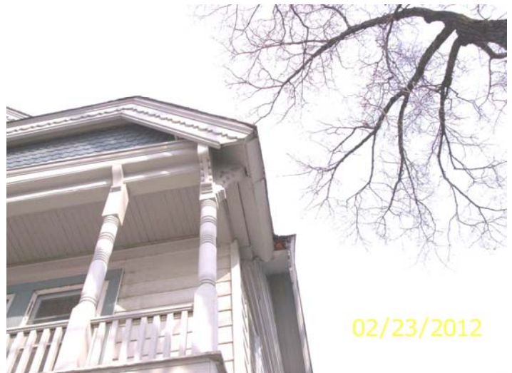
2 nd floor south side flat roof