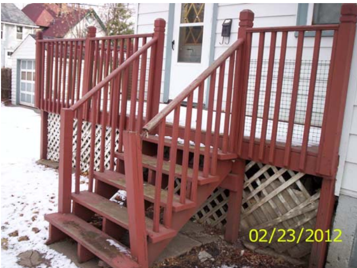
North most west side deck