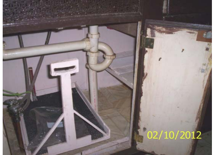
'S'trap unvented plumbing