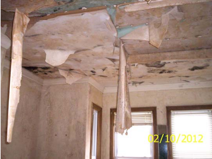
Water damaged walls and ceiling, mold

HP District: Property Name: Survey Info: