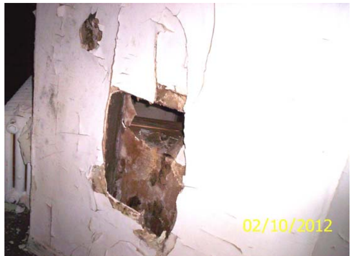
Water damaged, open wall, mold