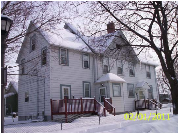
North and west sides