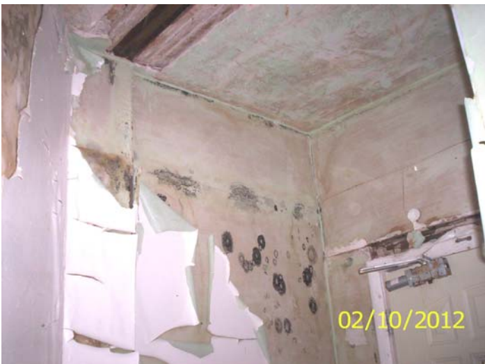
Water damaged walls and ceiling, mold