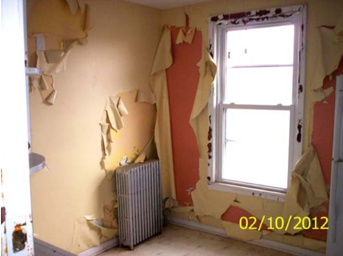
Water damaged walls, peeling paint

HP District: Property Name: Survey Info: