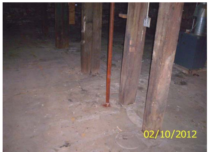
Posts in contact with the floor, water damaged