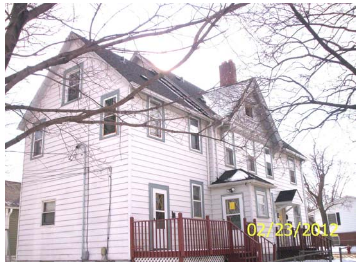
North and west sides