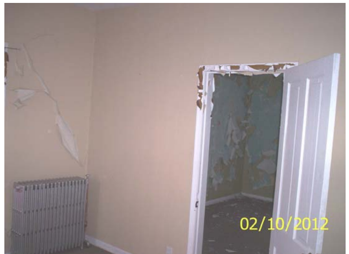
Water damaged walls and ceiling, peeling paint