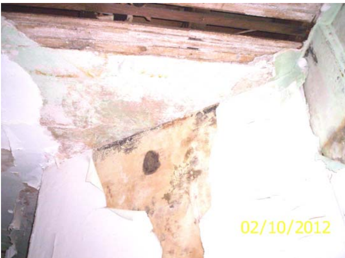
Water damaged walls and ceiling, mold