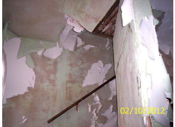
Water damaged walls and ceiling