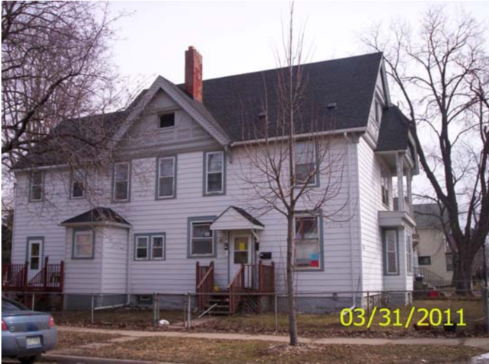
West side posting

HP District: Property Name: Survey Info: