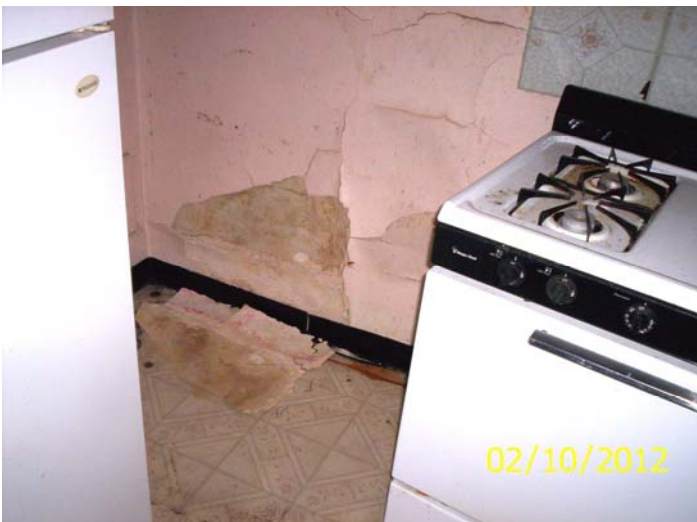
Water damaged floor covering and wall