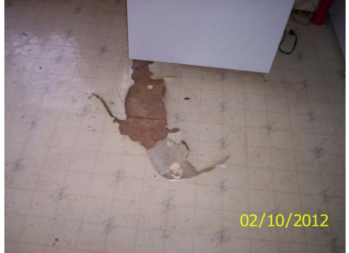
Damaged, open kitchen floor covering