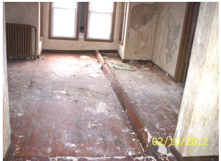
Water damaged, buckled, sloping floor