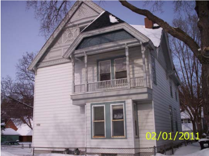
South and east sides

HP District: Property Name: Survey Info: