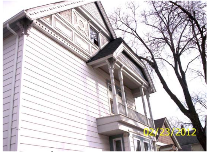
South side 2 nd floor flat roof