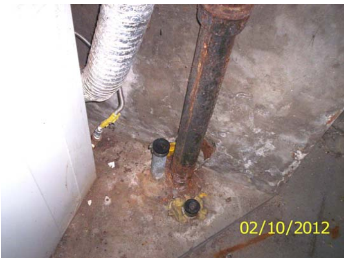
Open plumbing in basement