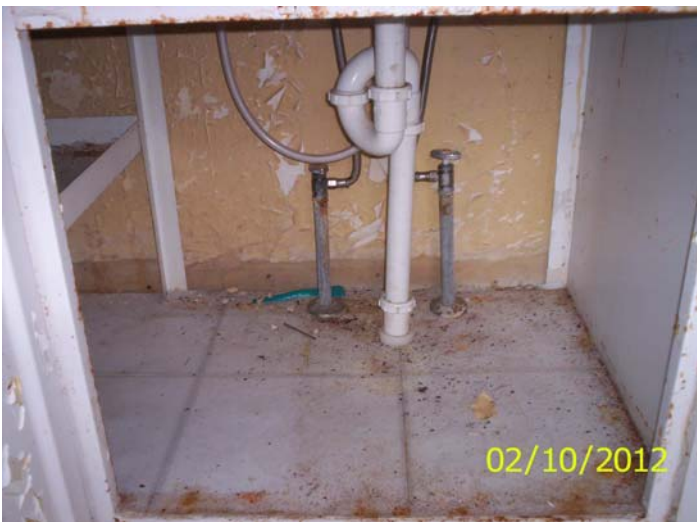
'S' trap unvented plumbing