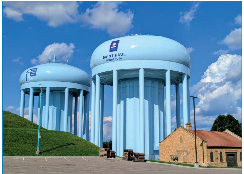
The blue Highland water towers #2 and #3 now sport fresh paint and SPRWS and City of Saint Paul logos.

maintenance like this extends the life of critical infrastructure and helps ensure continued delivery of safe, high-quality water. The upgraded coating system protects the steel surfaces from corrosion, while the safety improvements bring the tower up to current standards.