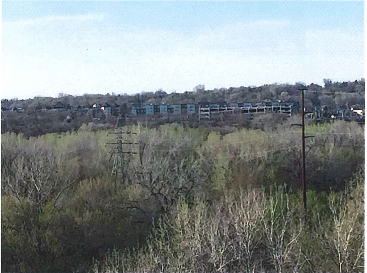
Pictured is a view of the property (located in front of the 44-foot parking garage and 55-foot Highland Pointe Development) from the Mendota Bridge. The secondary bluffline is visible behind the development.

2. To approve a variance to permit a building height of 73'4" in the RC3 (Urban Open District District), the Planning Commission must find the variance request meets the following test, spelled out in §68.601: