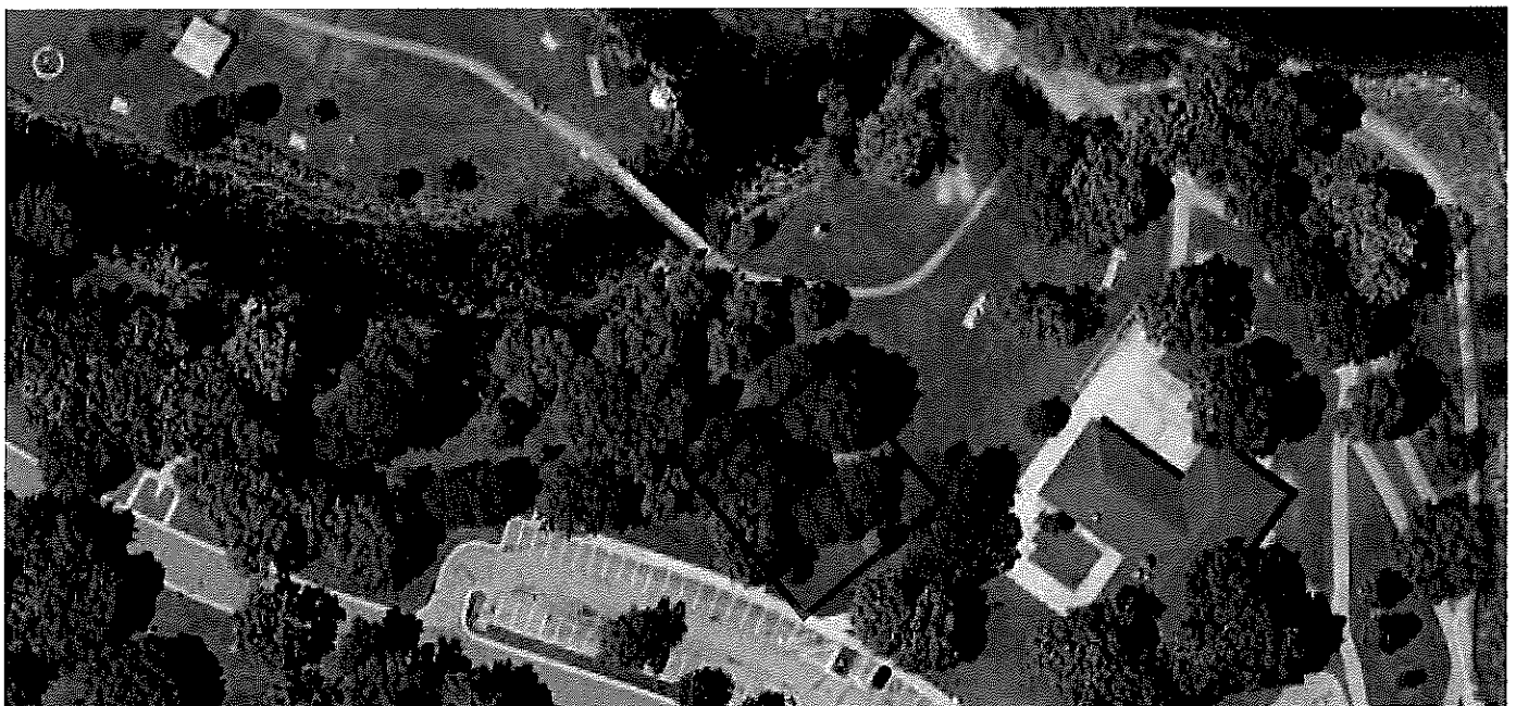
OVERALL SITE LOCATION - PHALEN LAKE AMPHITHEATER AREA