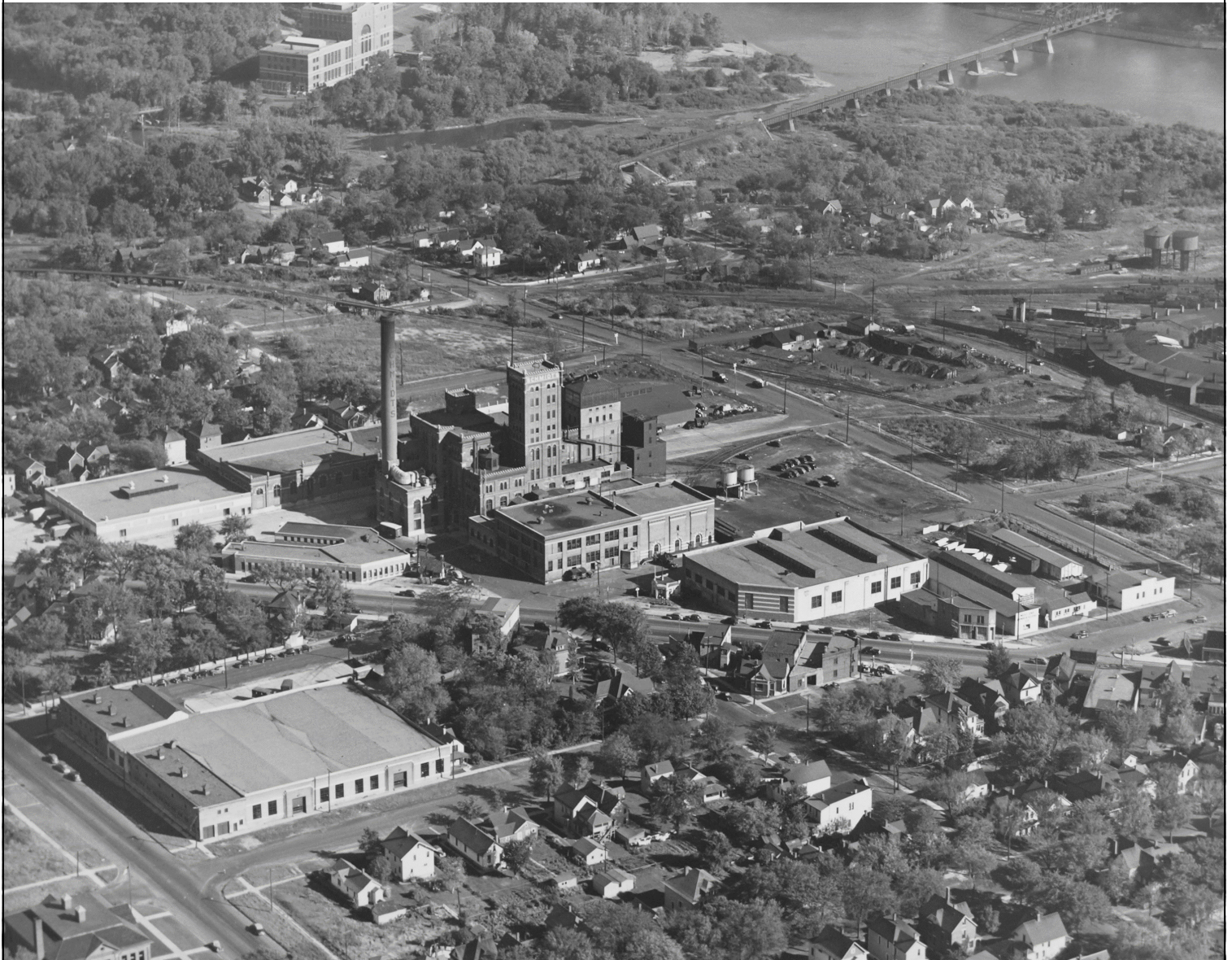
1948 Bird-eye view

St. Paul Heritage Preservation Commission