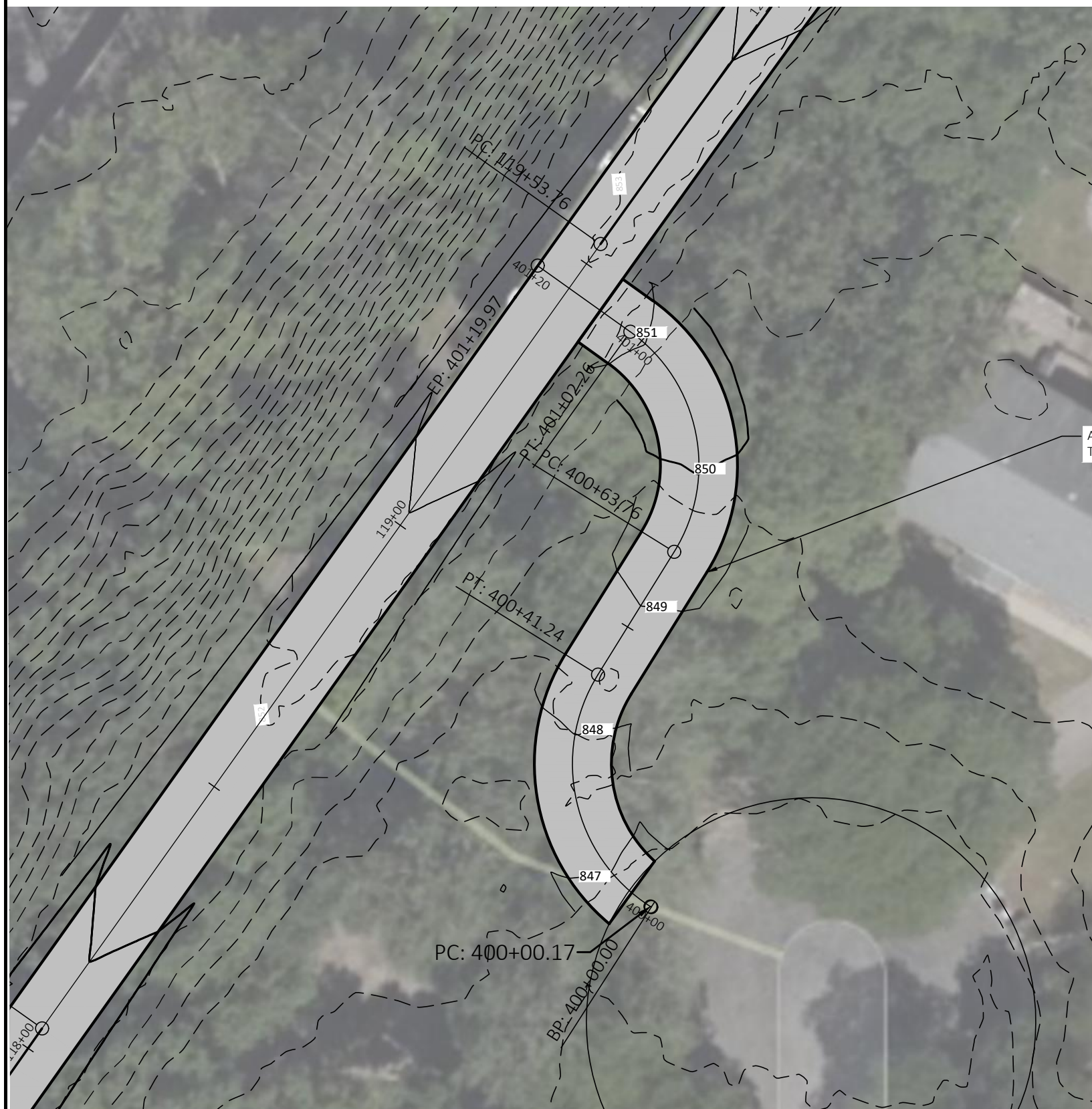
1 Plan View