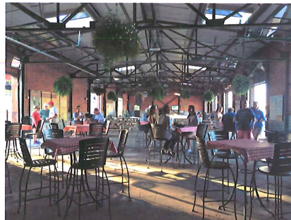
City House indoor space view to east