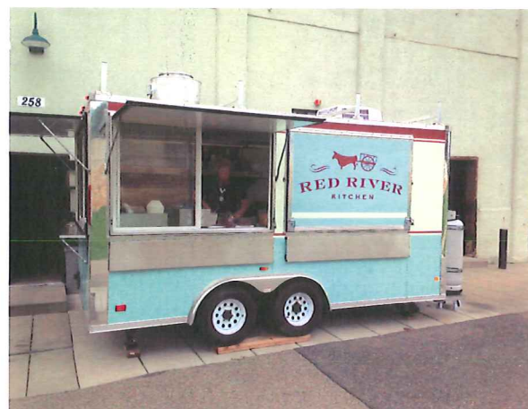
Red River Kitchen licensed food trailer