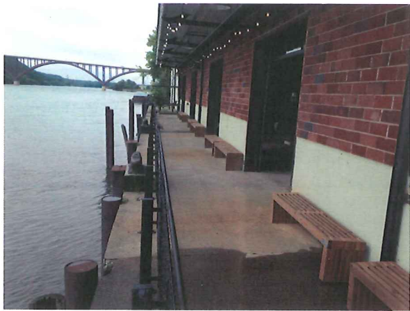
Patio/Deck on Mississippi River side of City House