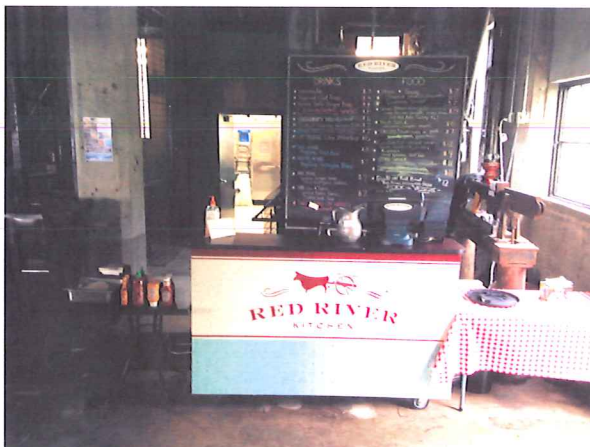
Customers place food and beverage orders here