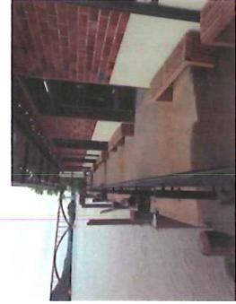
Patio / Deck