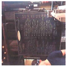
Temporary Menu Board