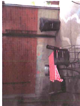
Patio / Deck