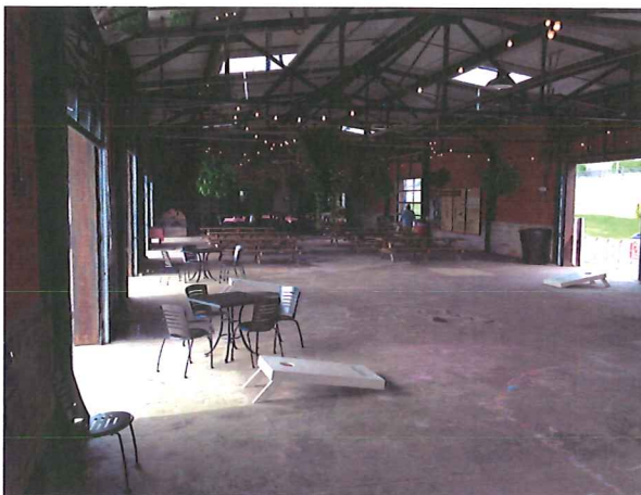
City House indoor space view to west