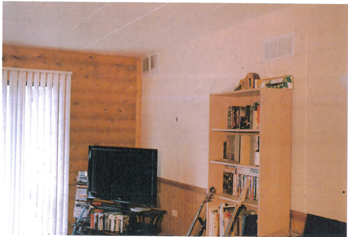
(over) Living Rm. Ceiling