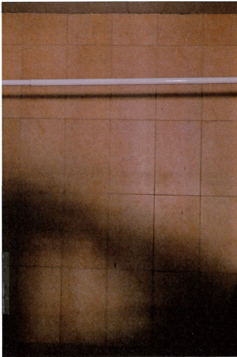
Tile around tub