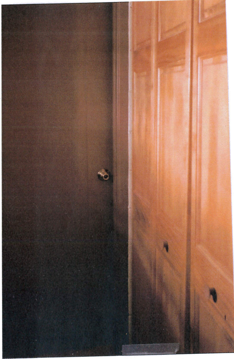
Steel Bed Rm. Dt. ↗