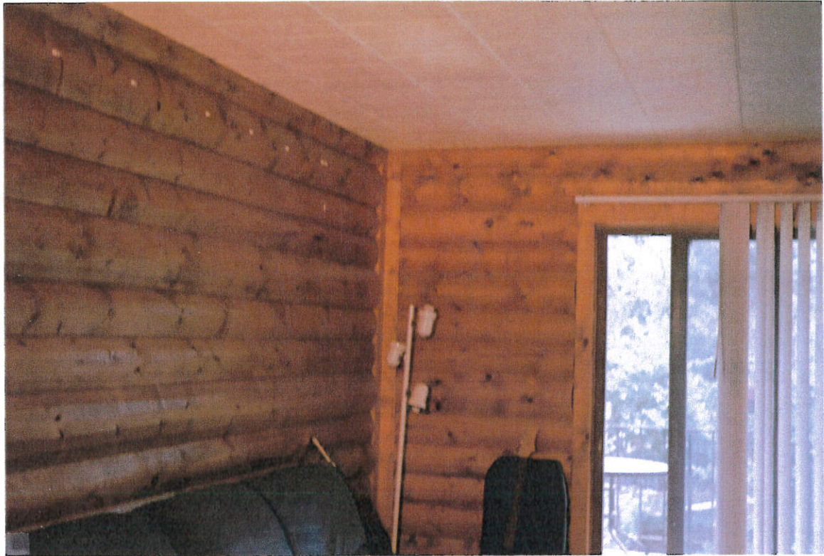
Living Rm. left side ↗ right side ↘