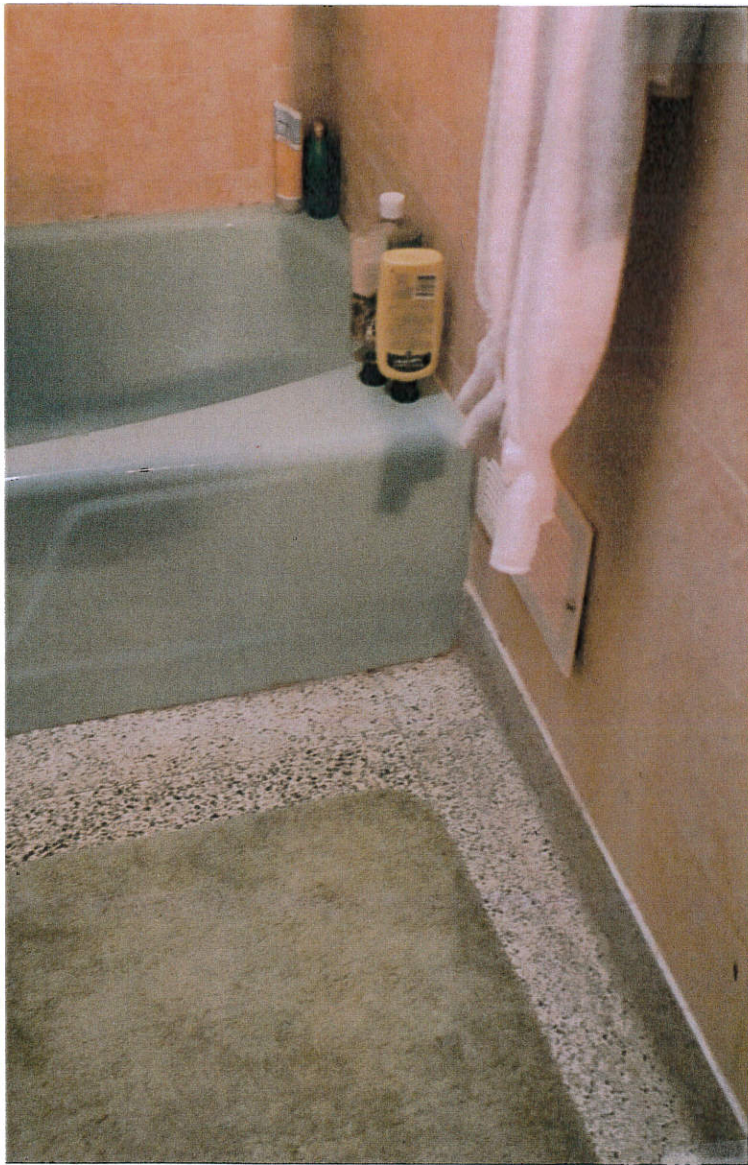
↑ floor tiles