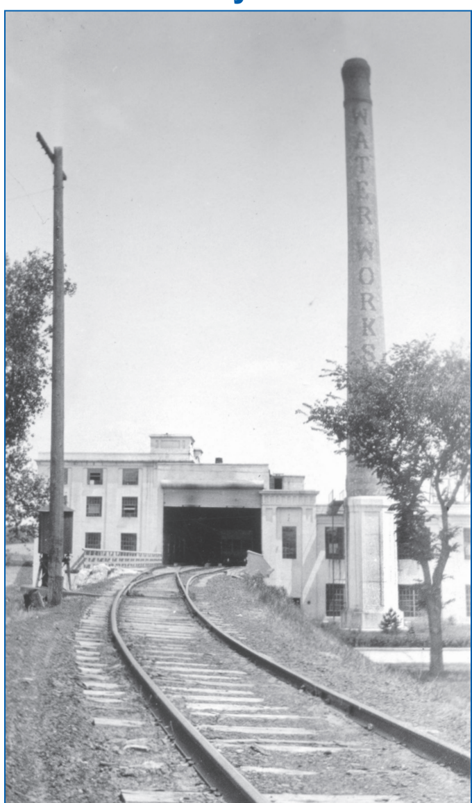
Staff have been scanning old photos of the plant and utility for a book on the plant to be done in conjunction with the new plant project. This is the treatment plant with the railroad entrance for chemical transports. Note the chimney that says "water works" in this undated photo.

Please remember to be respectful of our neighbors when leaving your shift at the end of the day and keep engine revving down.