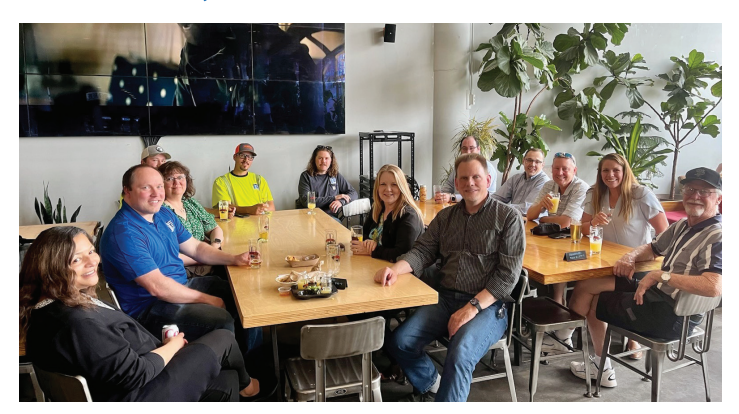
Staff met at Blackstack Brewing after work on Wednesday, May 24 for a no water, no cheers happy hour celebrating one of the many ways we use water.

The Pipeline Expr ess Vol. 24 No. 11 (June 2, 2