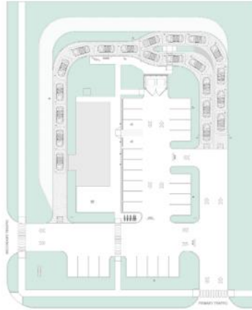
Single Order Point Y-Lane