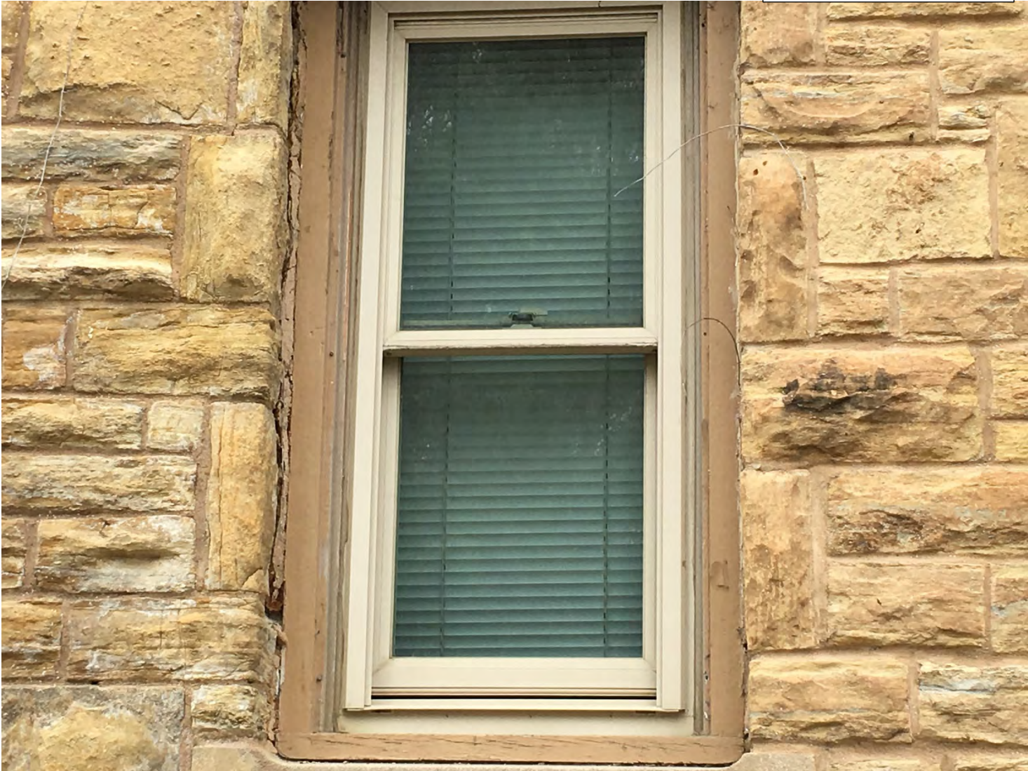
Example of window on west side

Date: April 25, 2019 File #: 17 - 217860 Folder Name: 705 SUMMIT AVE PIN: 022823140181