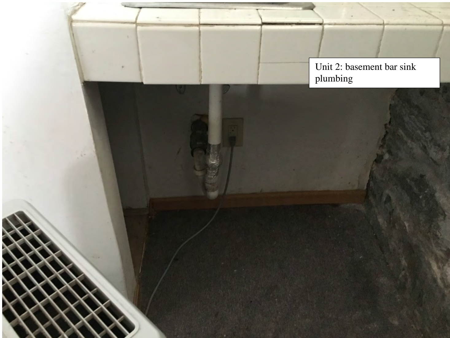
Unit 2: basement bar sink plumbing

Date: April 25, 2019 File #: 17 - 217860 Folder Name: 705 SUMMIT AVE PIN: 022823140181