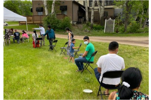
Waiting for Covid shots