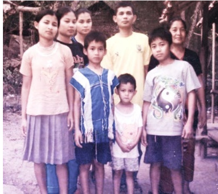
Some from refugee camps

Immigrants learn how to live in their new home