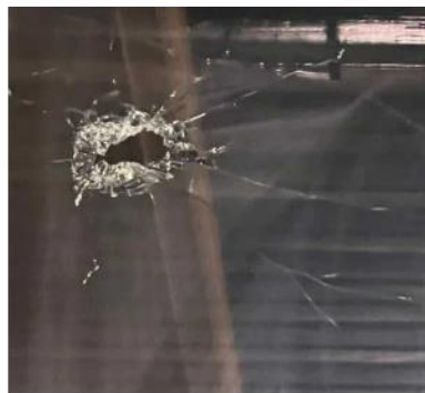
Thanks so much, Billy's on Grand, for the bullet hole on my porch from Saturday night! Billy's On Grand, Saint Paul, MN