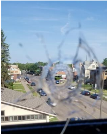
Bullet holes in kitchen window from shooting evening of 18 June 2022. Multiple shots fired.