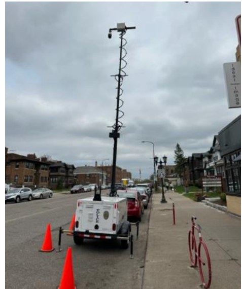
Police monitoring station now in place Directly across from Billy's - 9 May 2023