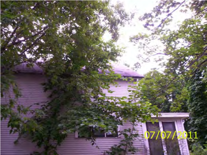
Missing shingles, damaged, open eave

HP District: Property Name: Survey Info: