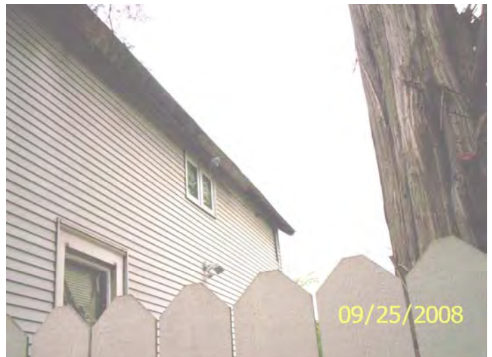
South side eaves