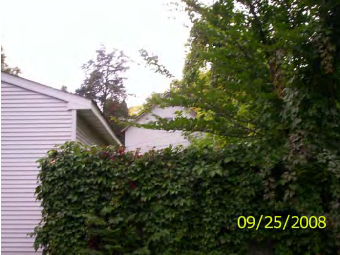
30 amp service drop

HP District: Property Name: Survey Info: