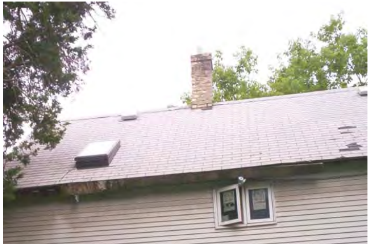
Missing shingles and chimney flashing (closer view)