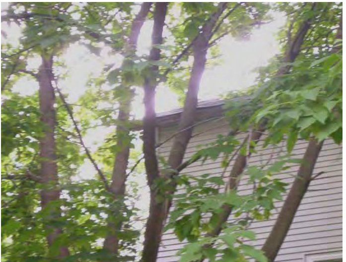
Eave damaged by tree and rot