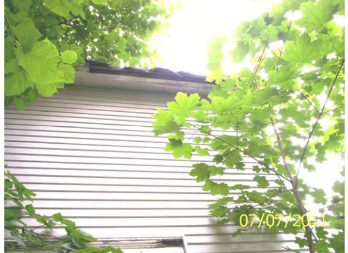
Damaged, open eave and roof