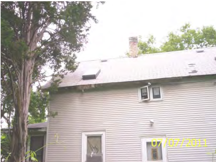
Rot damaged, open eave