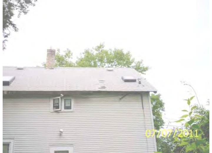
damaged, open eave