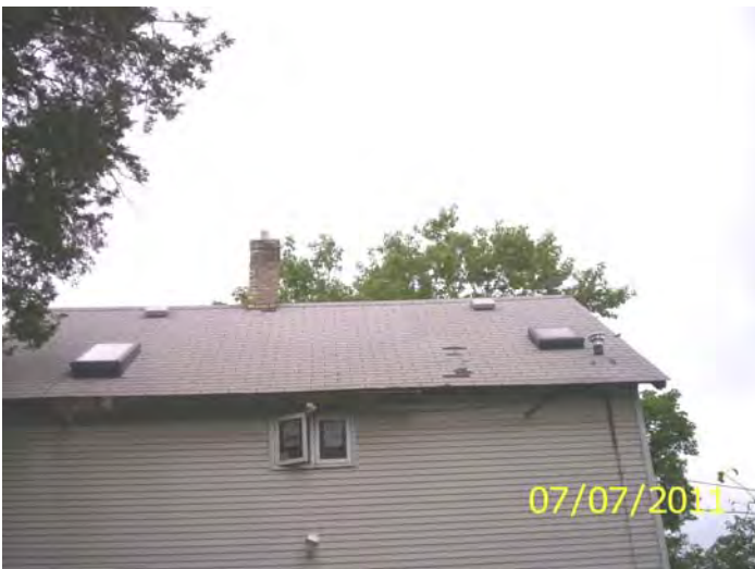
Missing shingles and chimney flashing