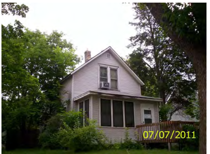
North and west sides