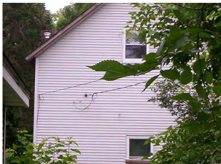
30-amp service drop (closer view)