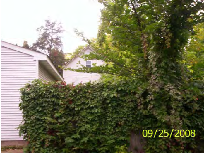
30 amp service drop

HP District: Property Name: Survey Info: