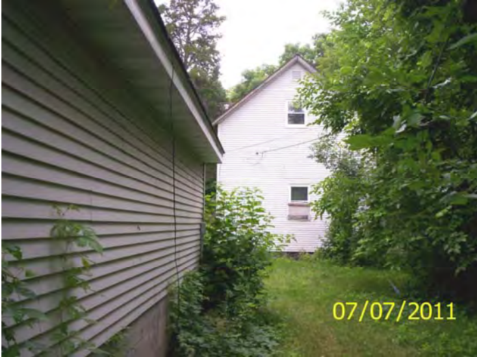
30-amp electrical service drop

HP District: Property Name: Survey Info: