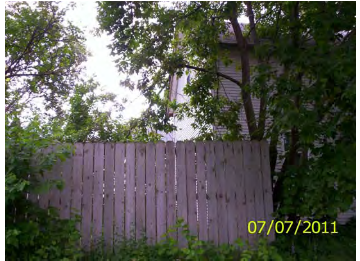
Eave and roof damage