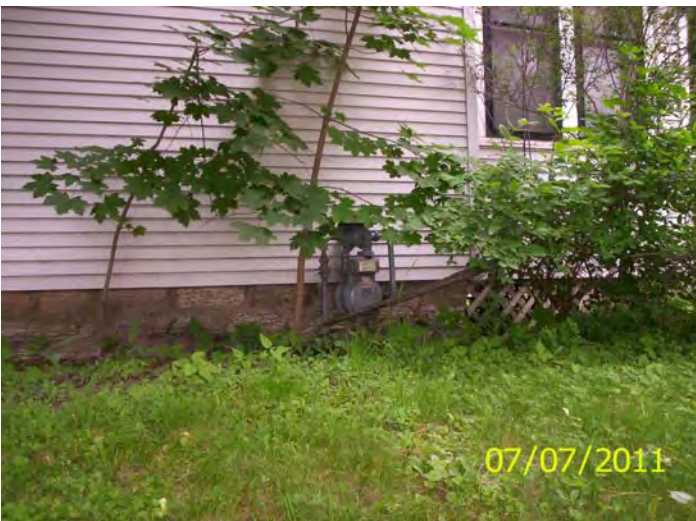
Gas meter locked off