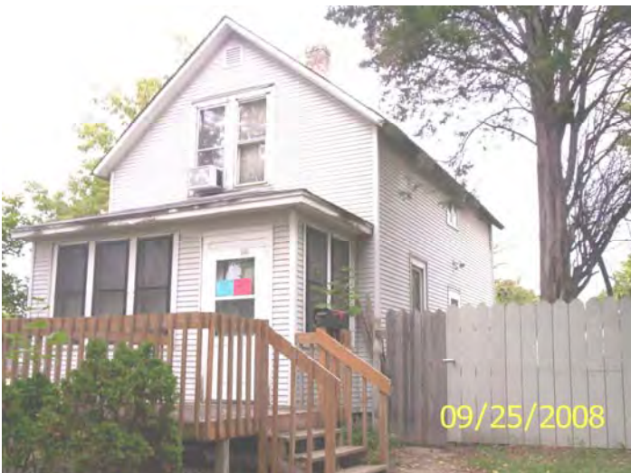
South and west sides, posting