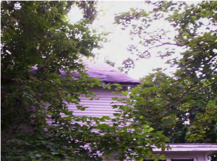
Closer view of missing shingles and damaged eave

HP District: Property Name: Survey Info: