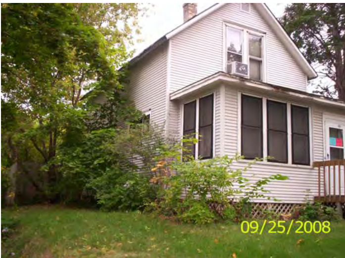
North and west sides, posting