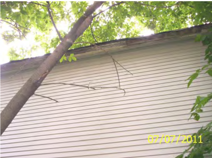
Damaged, open eave