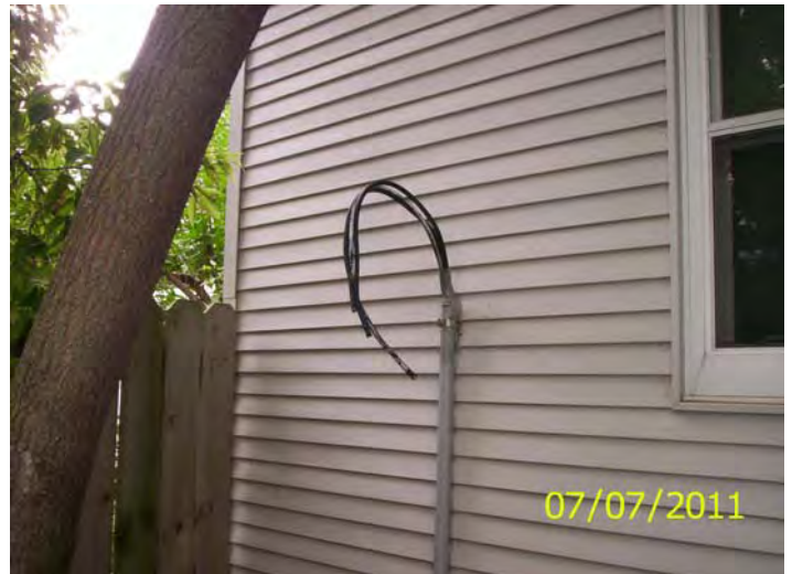
Unfinished electrical upgrade