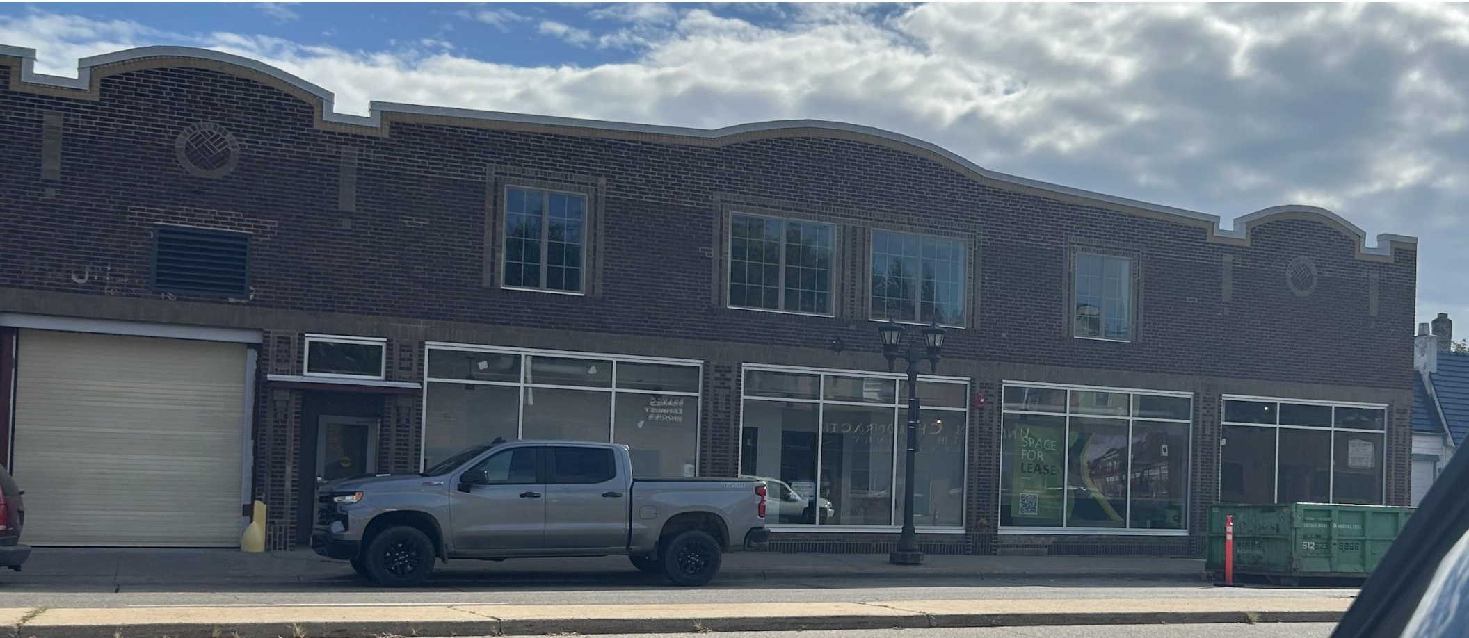
Façade on Snelling Avenue