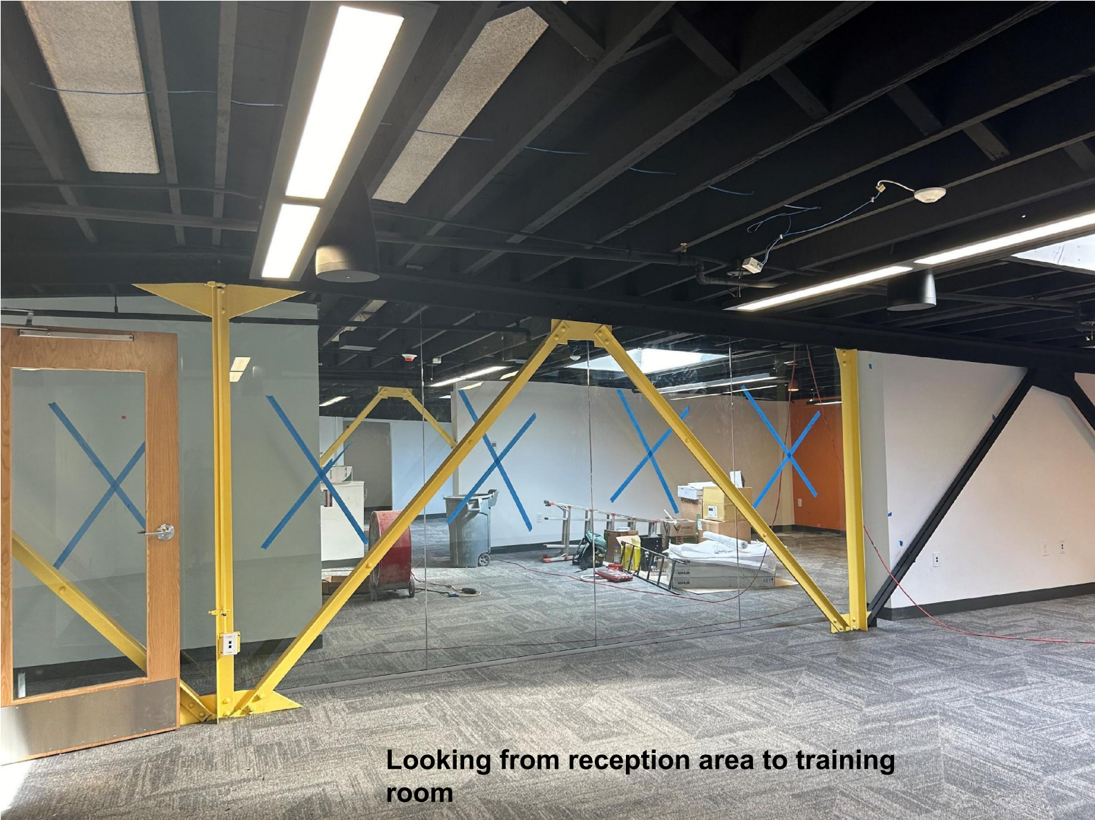
Looking from reception area to training room