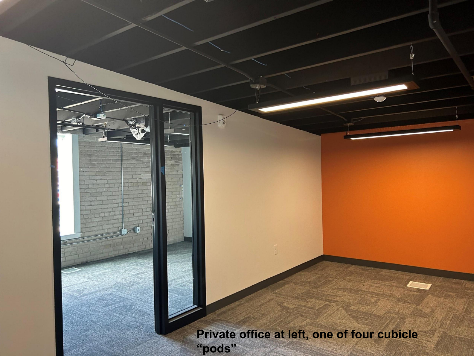
Private office at left, one of four cubicle “pods”