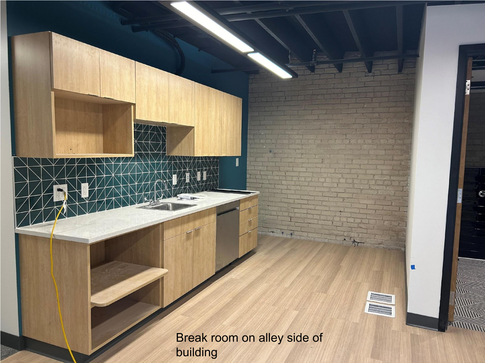
Break room on alley side of building