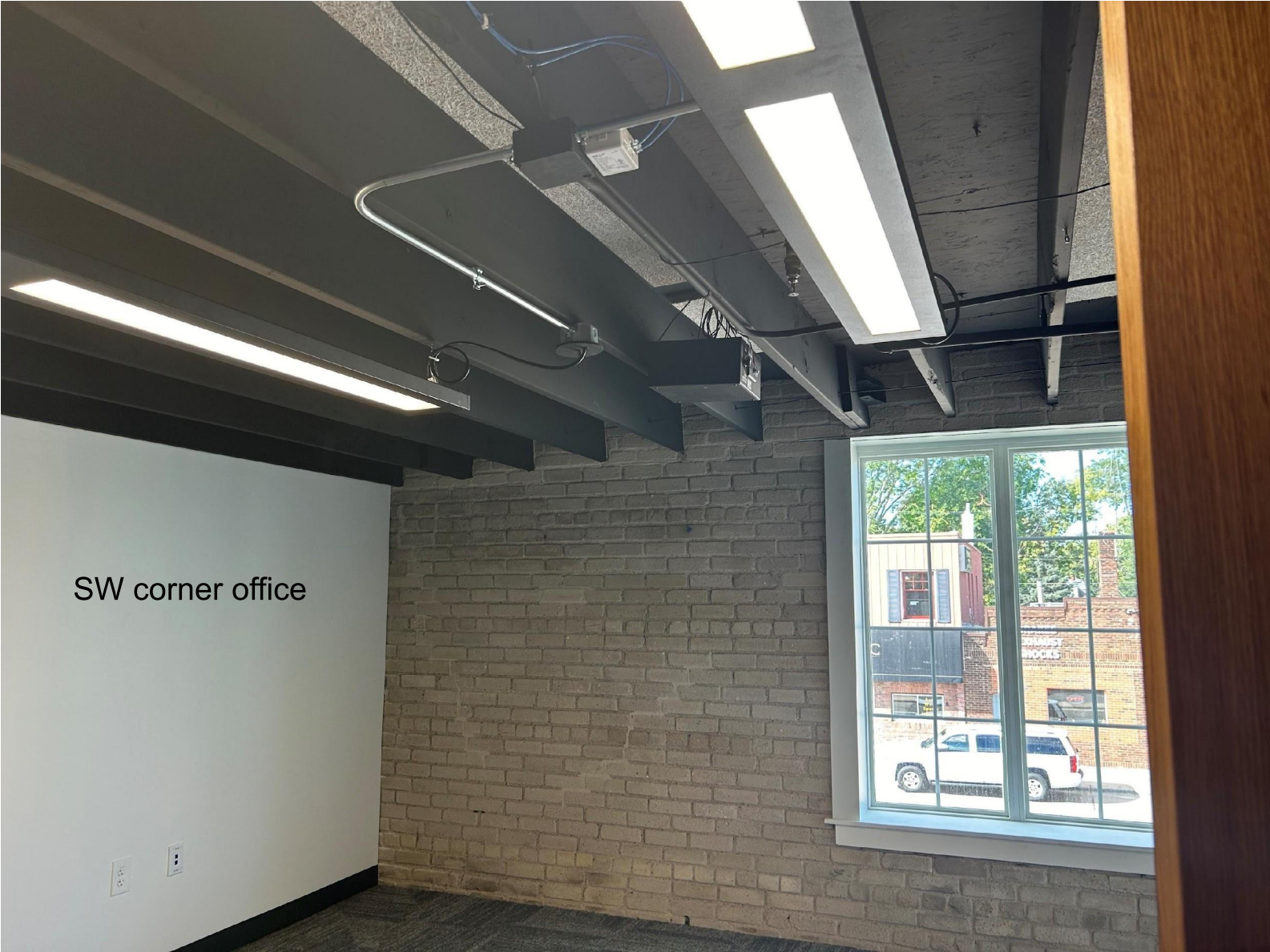
SW corner office