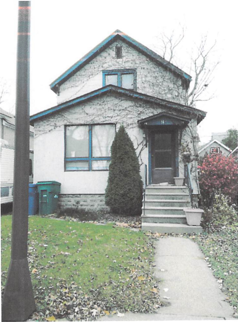
Front of home