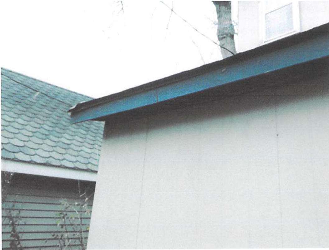
Soffit repair after