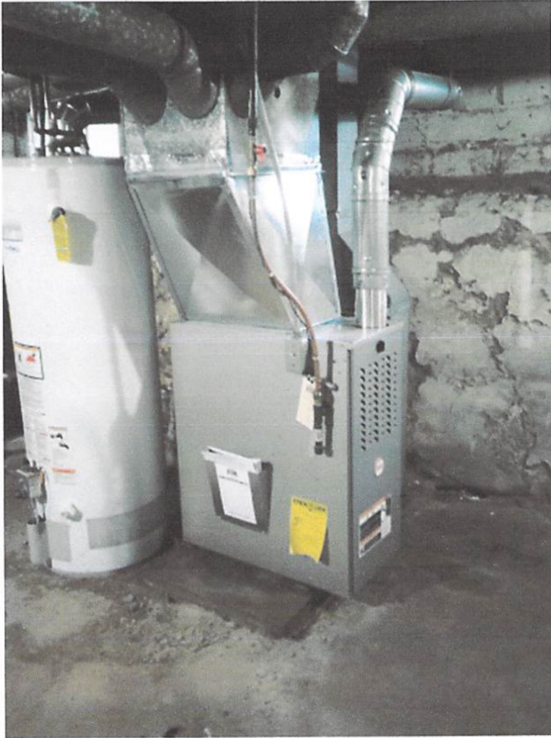
New furnace, cleared the area around it