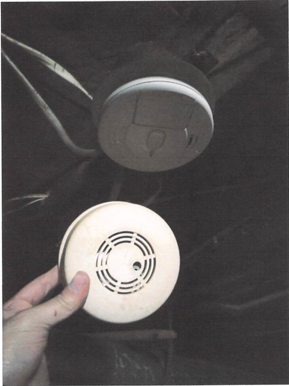
I have replaced the basement fire detector which had expired. Now all of the detectors in the home are up to date.