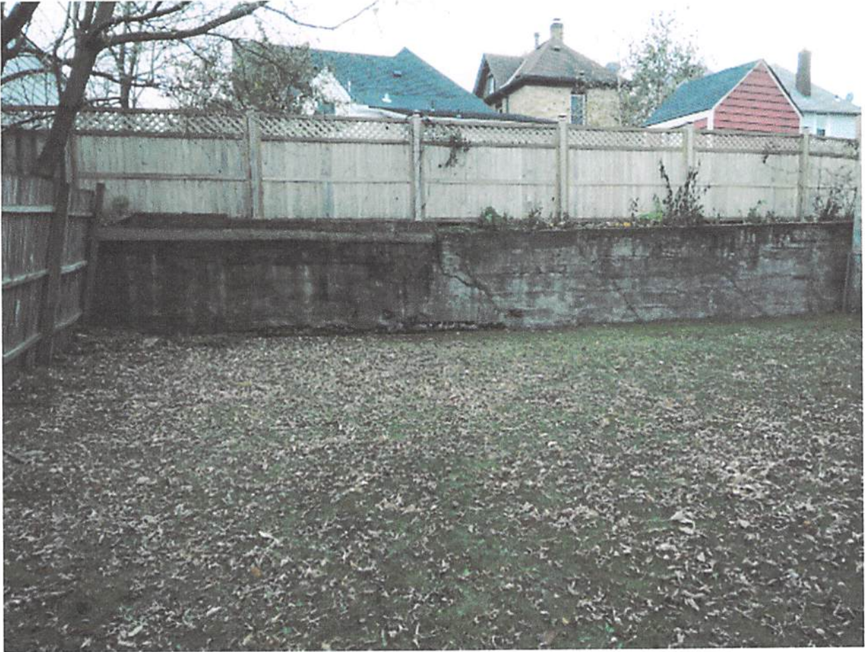
The back yard