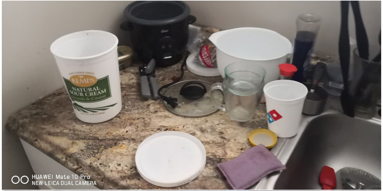
OO HUAWEI Mate 10 Pro NEW LEICA DUAL CAMERA