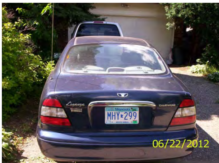
Vehicle with expired tab's