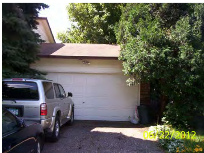
North side garage