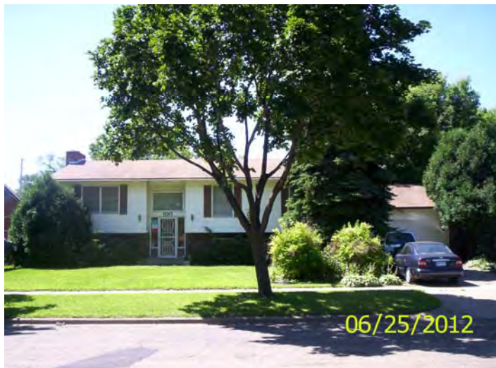
North side of house and garage, postings

HP District: Property Name: Survey Info: