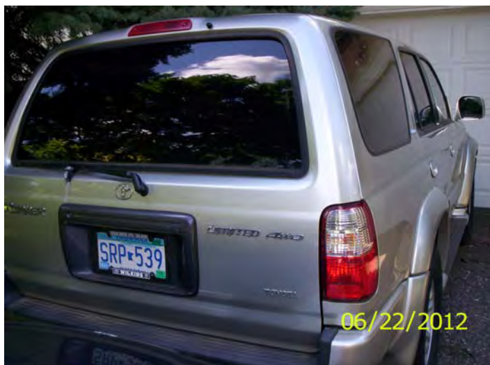
Vehicle with expired tab's