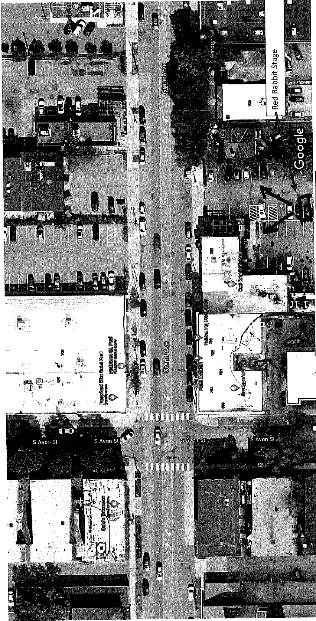
Tent Rental Detail: Wristband location and MPR Garden Tents/Tables Can start Saturday afternoon

ADDRESS: 788 (Red Rabbit -- Southside) 791 (Brasa -- MPR Stage/Garden -- Northside)