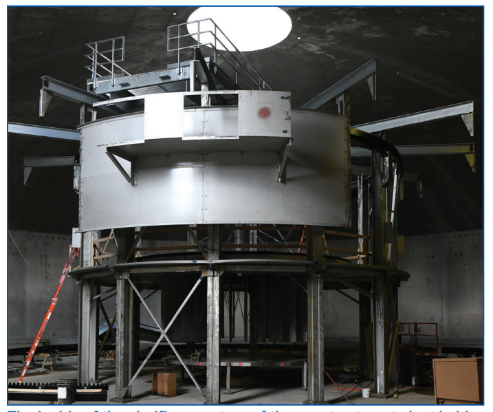
The inside of the clarifier on a tour of the new treatment plant held on May 24.