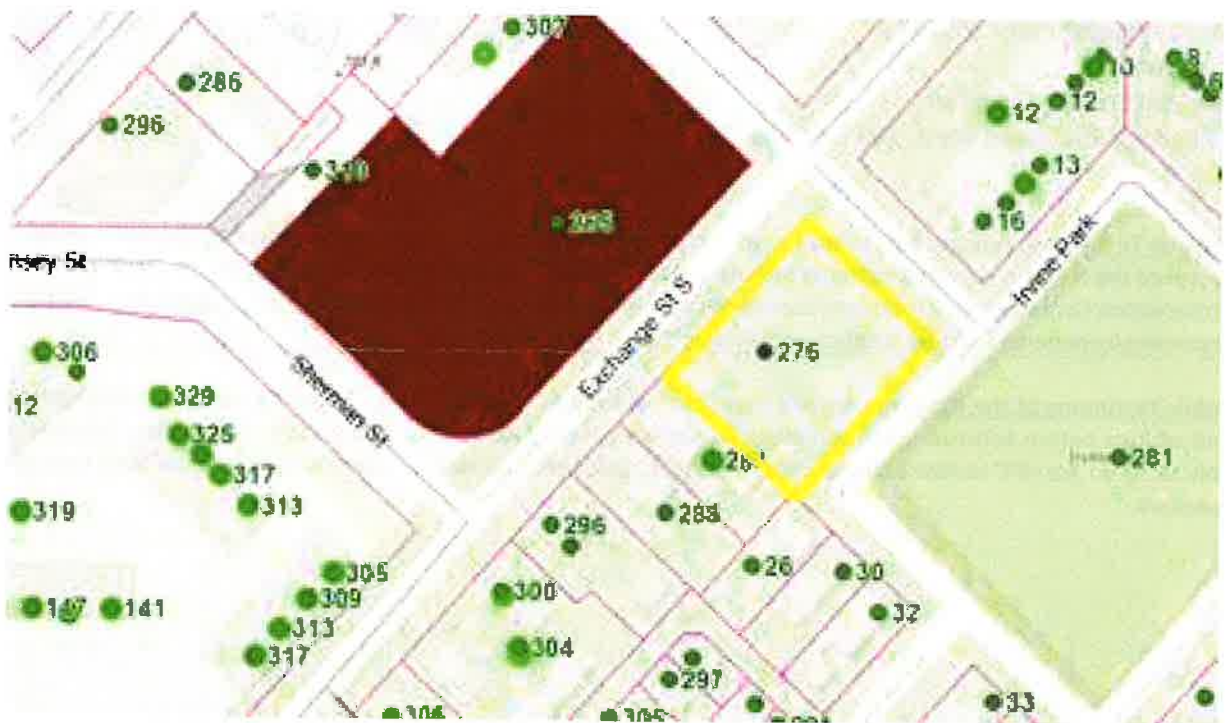
See <a href="https://www.stpaul.gov/departments/planning-economic-development/heritage-preservation/historic-districts-and-sites">https://www.stpaul.gov/departments/planning-economic-development/heritage-preservation/historic-districts-and-sites</a> for a searchable district map