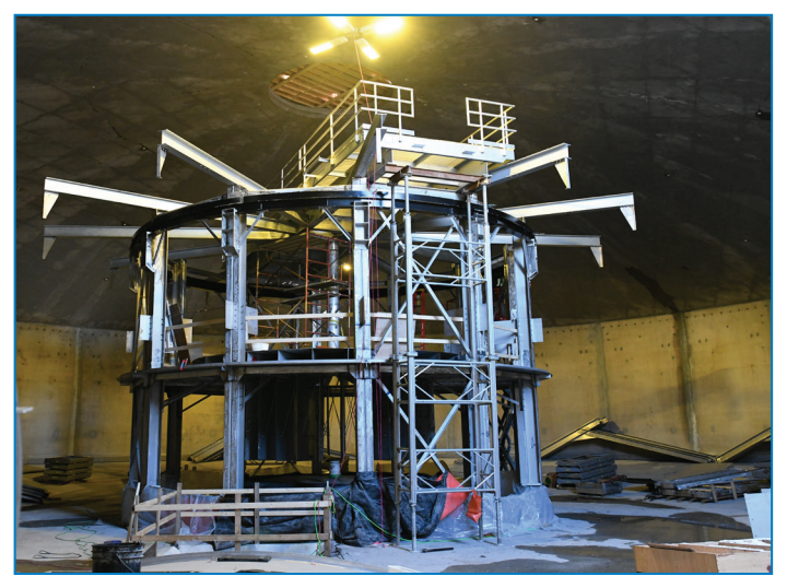
One of the four new clarifiers at the McCarrons Treatment Plant under construction on Feb. 15. Progress continues on the plant even as much of the work is no longer visible from the current plant's roof tops.