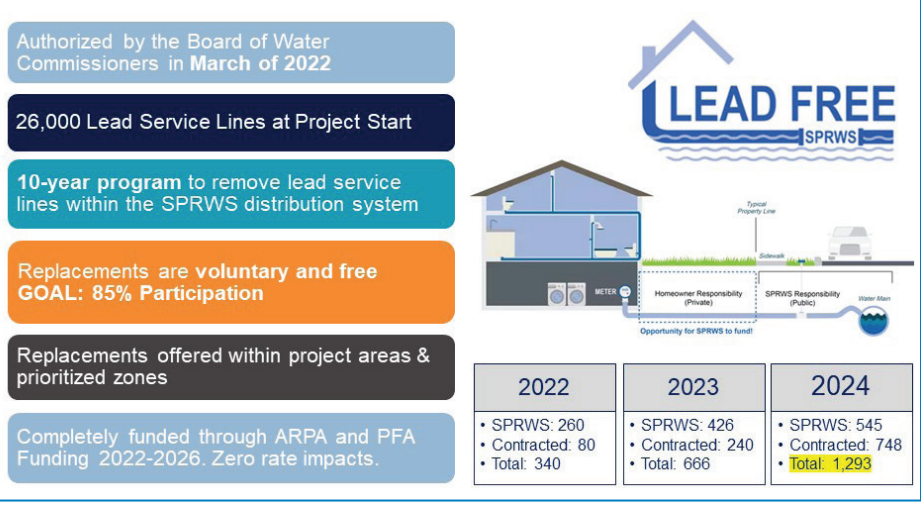
The Lead Free SPRWS program has replaced 1,000 lead service lines in the first two years and plans on replacing another 1,293 lead service lines in 2024, a majority of them by using contractors. The replacement funding comes from either the American Rescue Plan Act or the Public Facilities Authority and does not impact water rates.