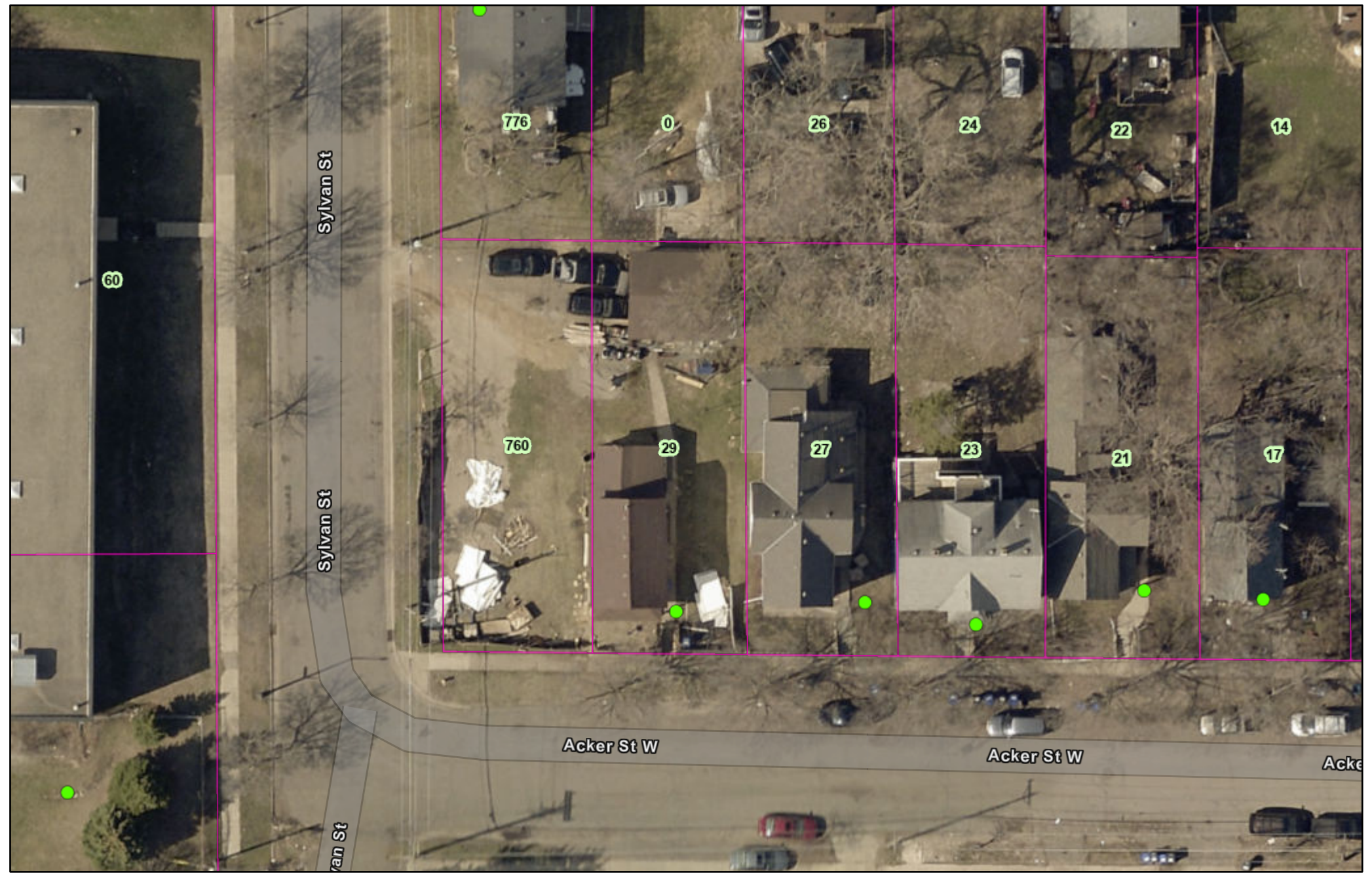
1/22/2024 9:49 AM

Esri Community Maps Contributors, County of Ramsey, Metropolitan Council, MetroGIS, © OpenStreetMap, Microsoft, Esri, TomTom, Garmin, SafeGraph, GeoTechnologies, Inc, METI/NASA, USGS, EPA, NPS, US