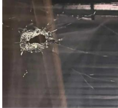
Thanks so much, Billy's on Grand, for the bullet hole on my porch from Saturday night! Billy's On Grand, Saint Paul, MN