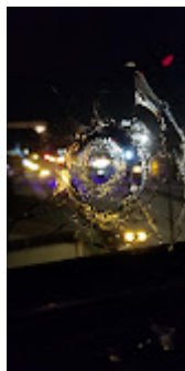
Bullet hole in window evening of incident 18 June 2022 from Grand by Billys.jpg 131K