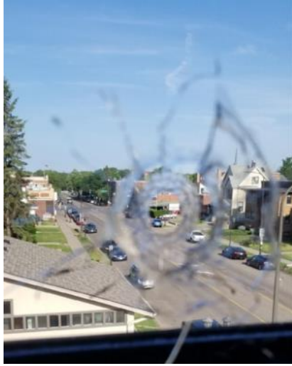
Bullet holes in kitchen window from shooting evening of 18 June 2022. Multiple shots fired.