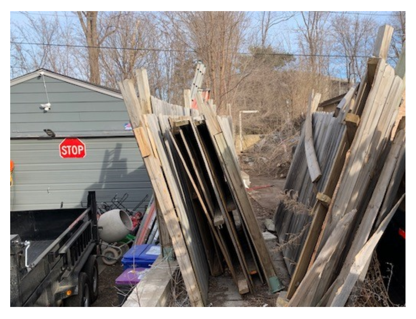
Sent from my iPhone