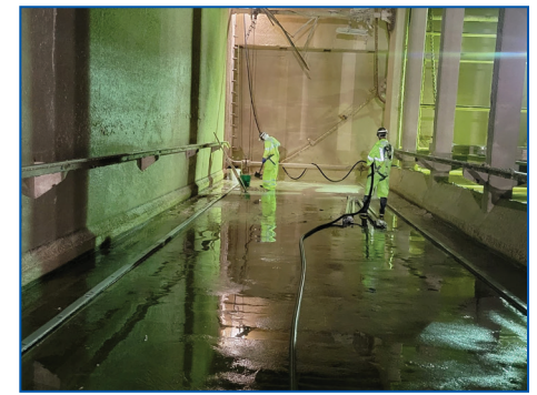
Workers clean out clarifier three after all of the chains have been removed from one section for repair.