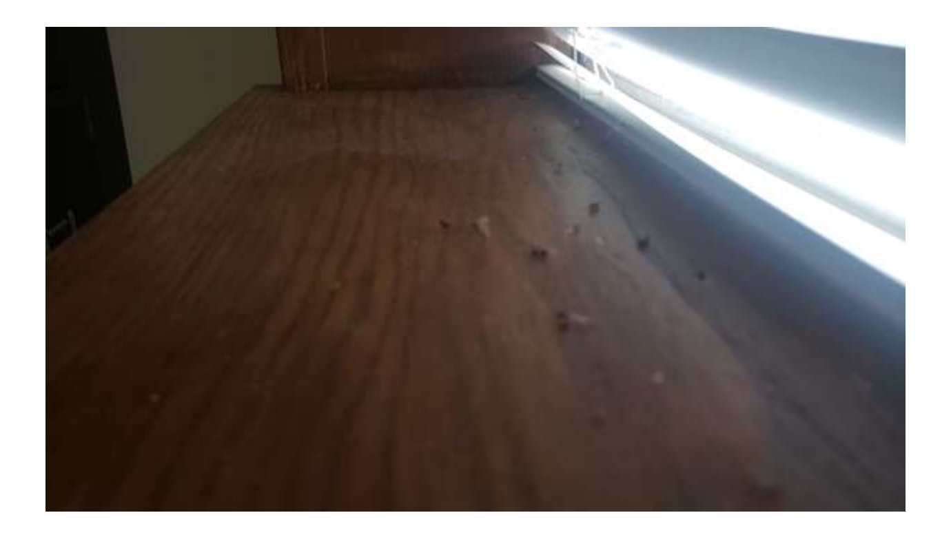
1485 Saint Paul Avenue.12/28/23