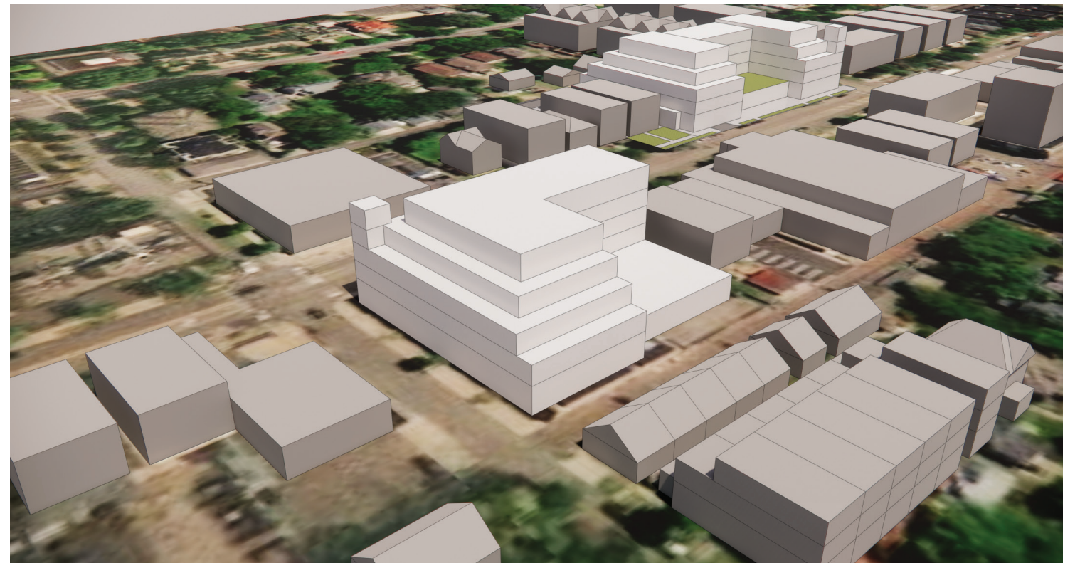
734 Grand: Massing as restricted by proposed amendments