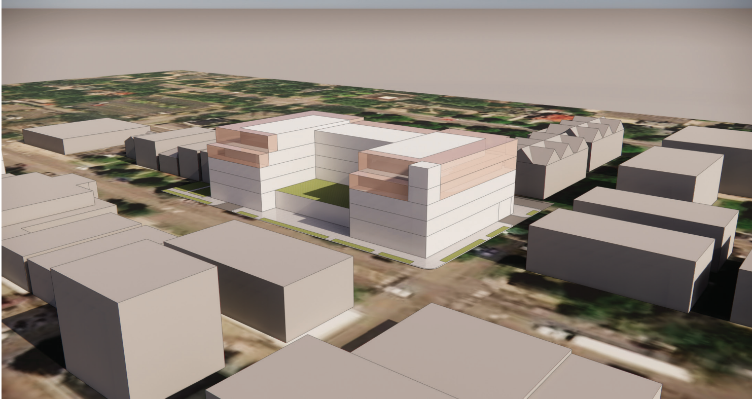
695 Grand Ave: Highlighted area of built project that would not be allowed under proposed restrictions