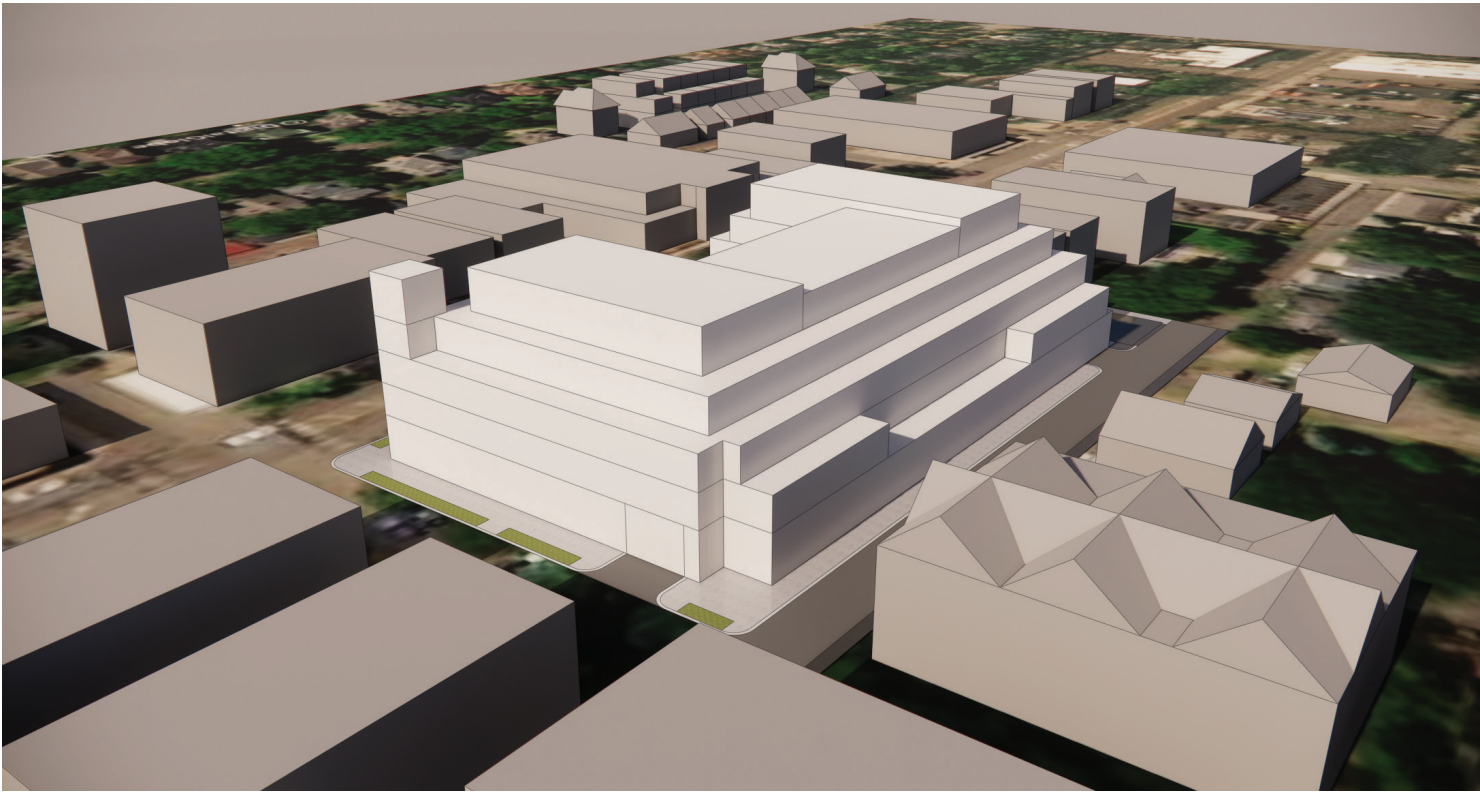
695 Grand: Massing as restricted by proposed amendments