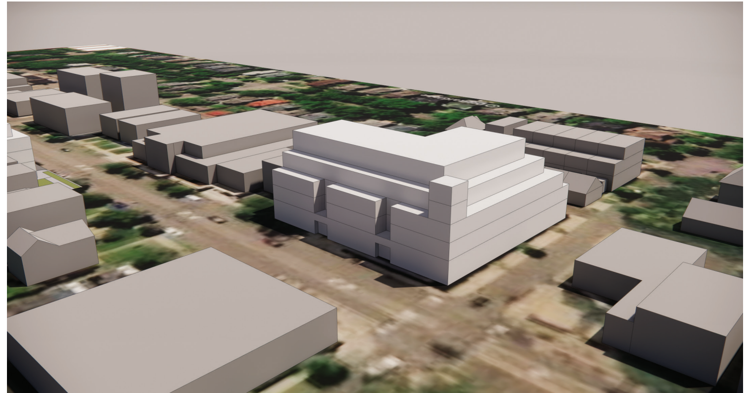
734 Grand: Massing as restricted by proposed amendments