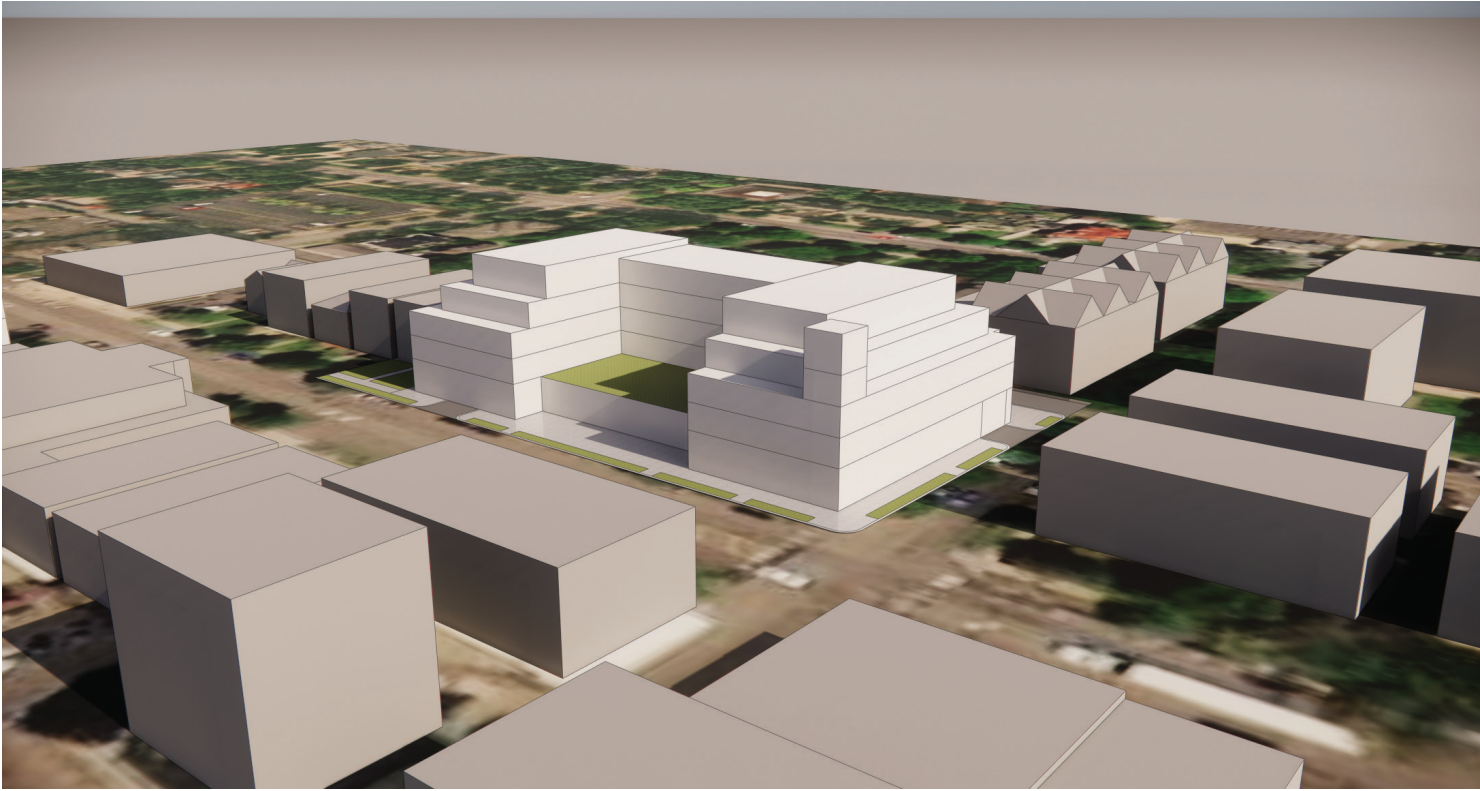
695 Grand Ave: Massing as restricted by proposed amendments