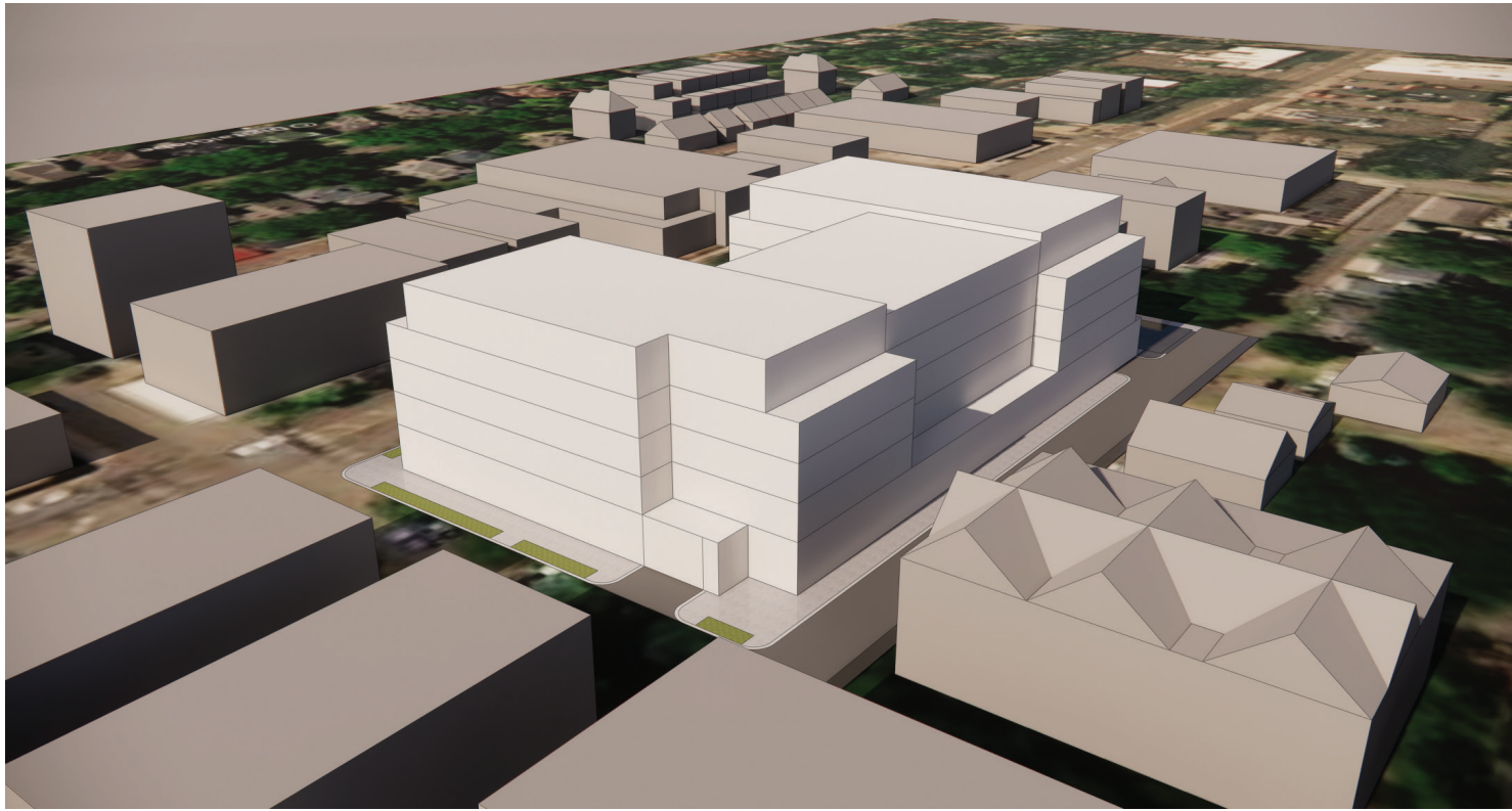
695 Grand Ave: Possible Massing