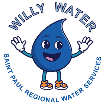
Willy Water, the new SPRWS mascot, will make his debut at the Highland Park water tower open house this weekend. The mascot is a nod to a previous mascot, Willing Water that had been in use several decades ago at the water utility.

Stickers and an activity book featuring Willy Water will be available for children visiting the tower.