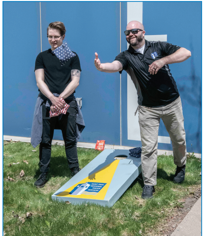
Games like bags may be part of the fun on the first ever SPRWS family fun day on Sept. 17.