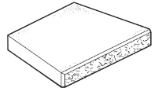
Standard – 12 x 7 <sup>5/8</sup> x 12 <sup>1/2</sup> (Front finish)