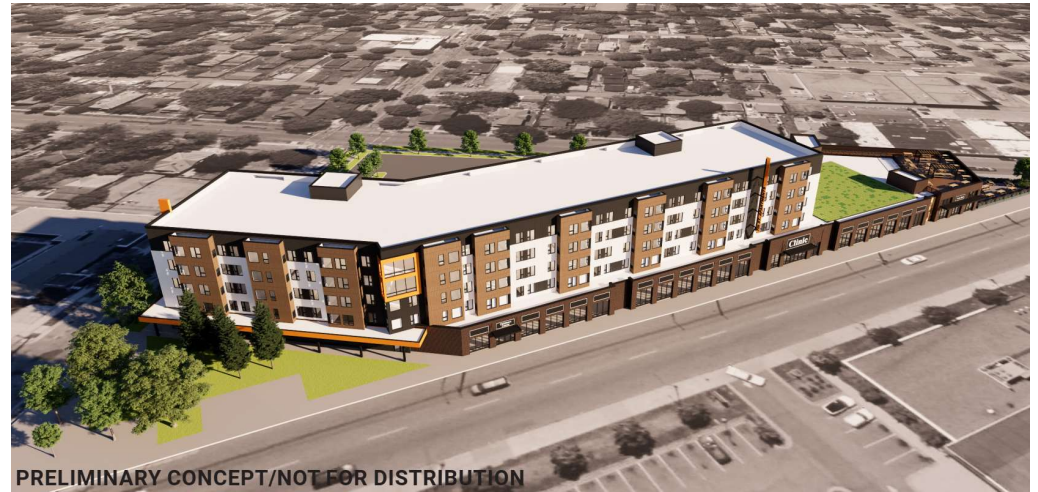
PRELIMINARY CONCEPT/NOT FOR DISTRIBUTION