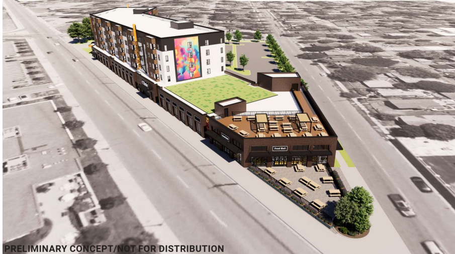
PRELIMINARY CONCEPT/NOT FOR DISTRIBUTION