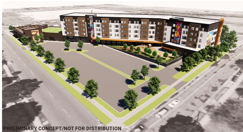
PRELIMINARY CONCEPT/NOT FOR DISTRIBUTION