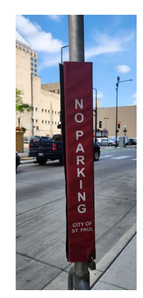
Sample hooded numbered sign blade for a metered parking space.