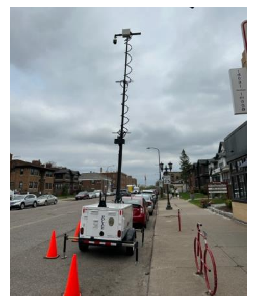
Police monitoring station now in place Directly across from Billy's - 9 May 2023