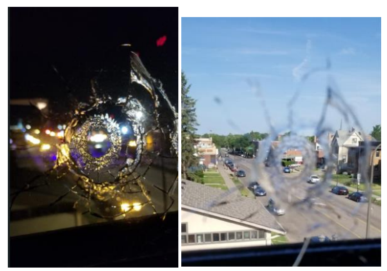
Bullet holes in kitchen window from shooting evening of 18 June 2022. Multiple shots fired.