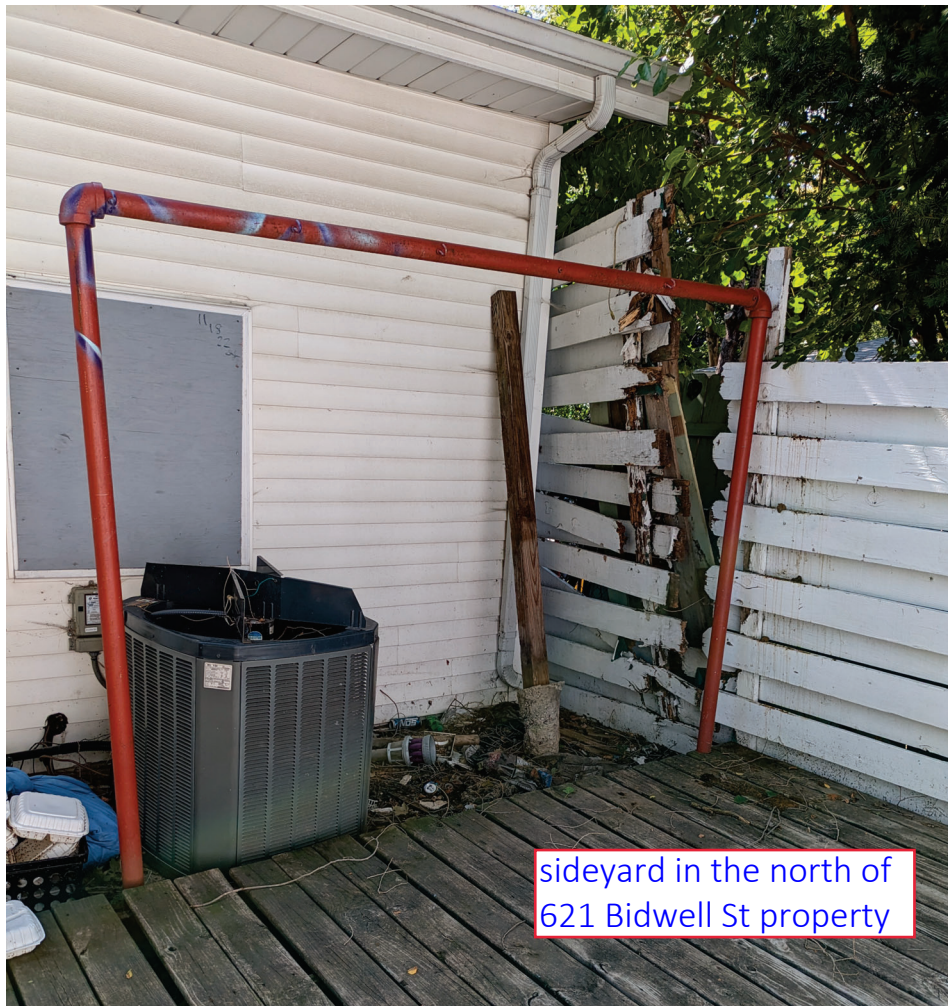
sideyard in the north of 621 Bidwell St property