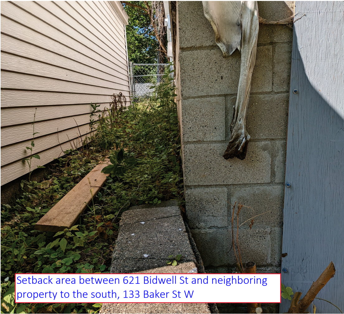
Setback area between 621 Bidwell St and neighboring property to the south, 133 Baker St W