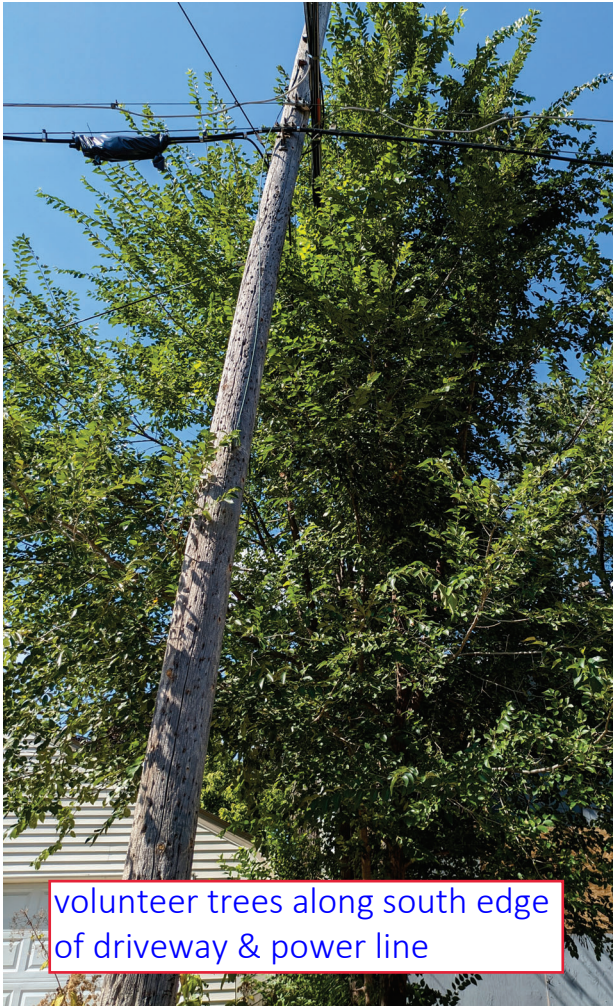
volunteer trees along south edge of driveway & power line