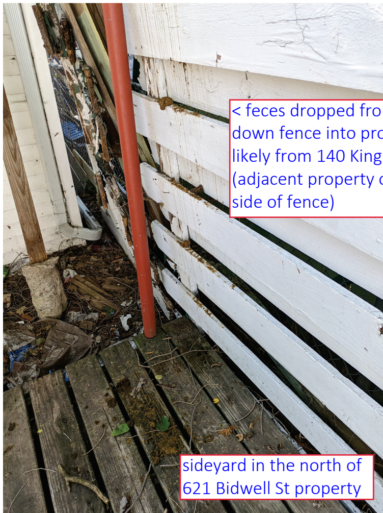
< feces dropped from above down fence into property, likely from 140 King St W (adjacent property on other side of fence)