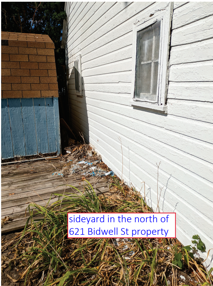
sideyard in the north of 621 Bidwell St property