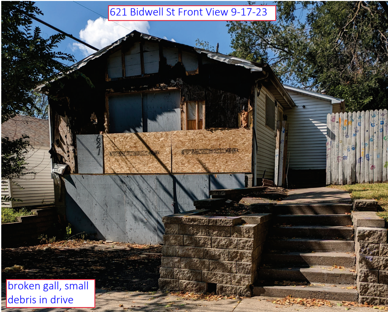
broken gall, small debris in drive