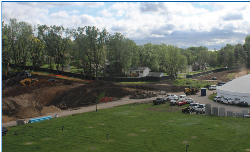
The area to the north of the round clarifier is getting set up to be the staging area for the McCarrons plant project. Crews continue to