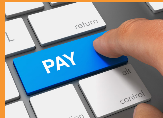
MINIMUM WAGE ENFORCEMENT