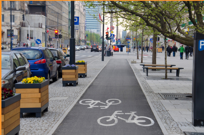
TRANSPORTATION AND BIKE LANES