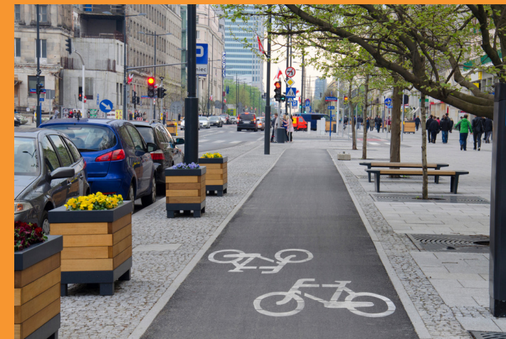
TRANSPORTATION AND BIKE LANES