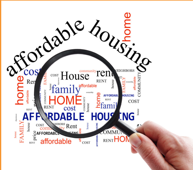
MORE INVESTMENT IN HOUSING