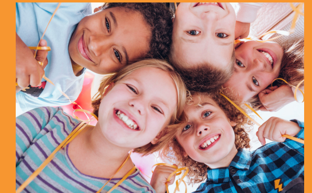
INVEST IN YOUTH