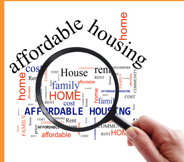
MORE INVESTMENT IN HOUSING