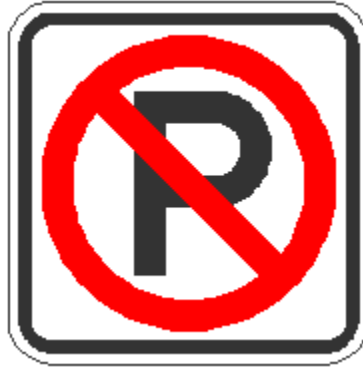
Typical Sign Placement*