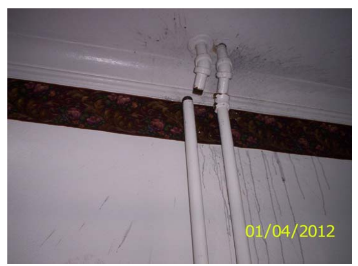
Blown out hot water heating line