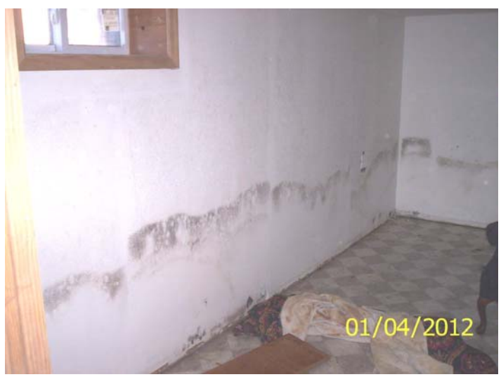
Water damaged wall, mold