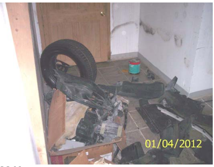
Mold, auto parts storage