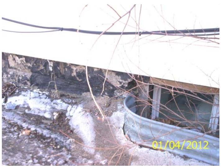
Open foundation wall, shifted block