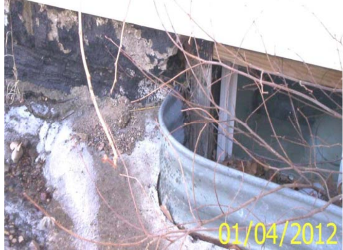
Close view of open foundation, shifted foundation block and missing mortar joint, debris pile