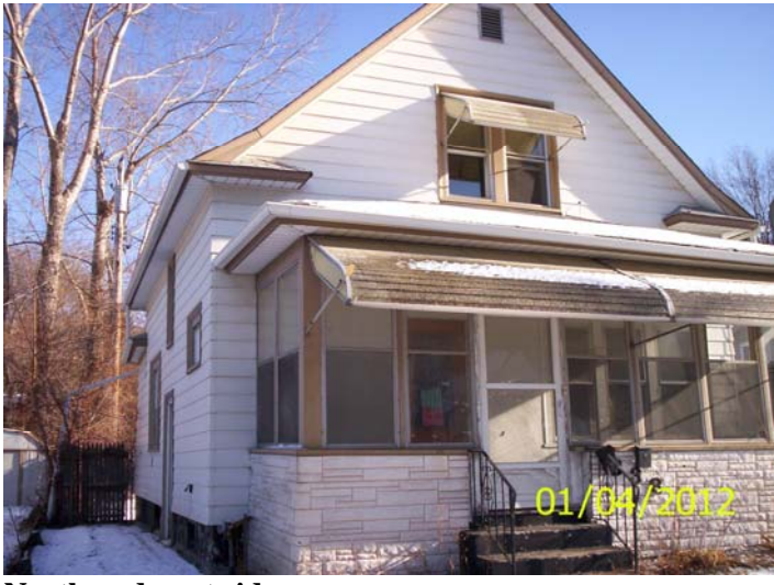
North and west sides