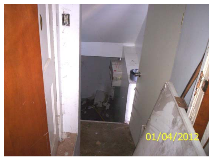
Missing cover plate, exposed wiring, damaged door frame Missing floor board, missing wall mounted heater, open