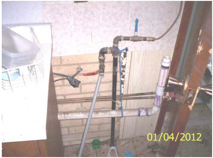
Improper electrical splice, open plumbing