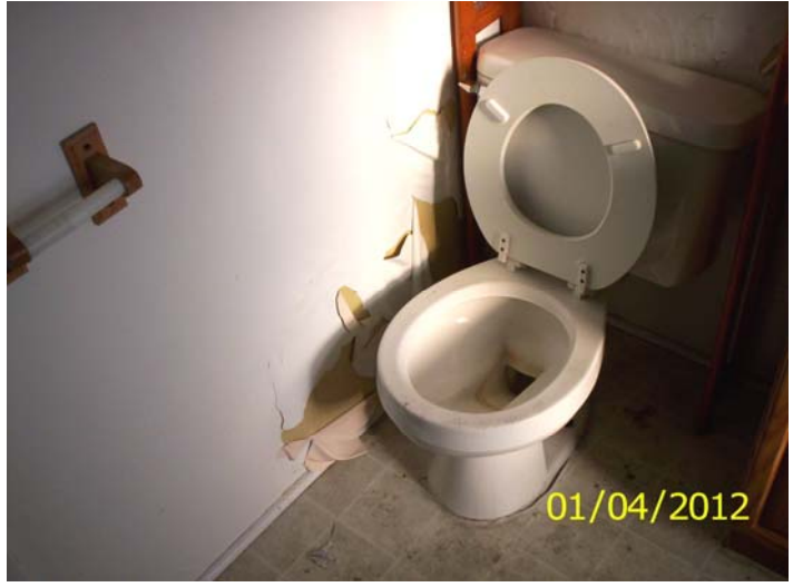
Chipped/peeling paint, dry water trap, open floor covering