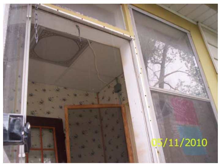
Unapproved electrical wiring on rear porch