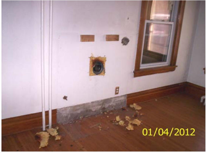
Wall, cut gas line for heater