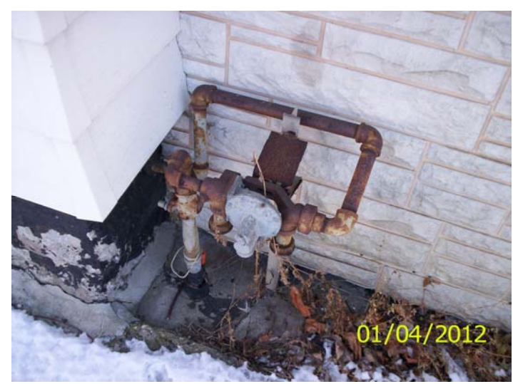
Gas meter removed