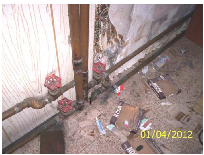
Water damaged wall, open water line, mold