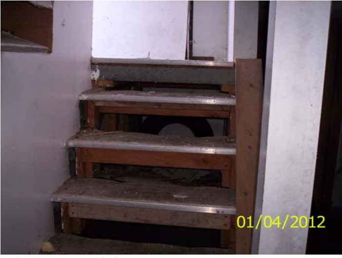
Missing hand rail for basement steps