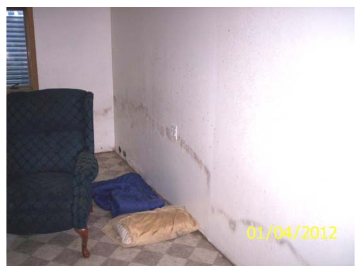
Mold in basement