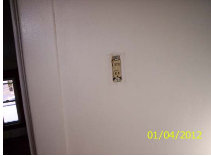
Missing cover plate; exposed wiring