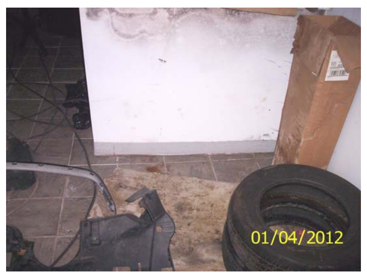
Mold, auto parts storage