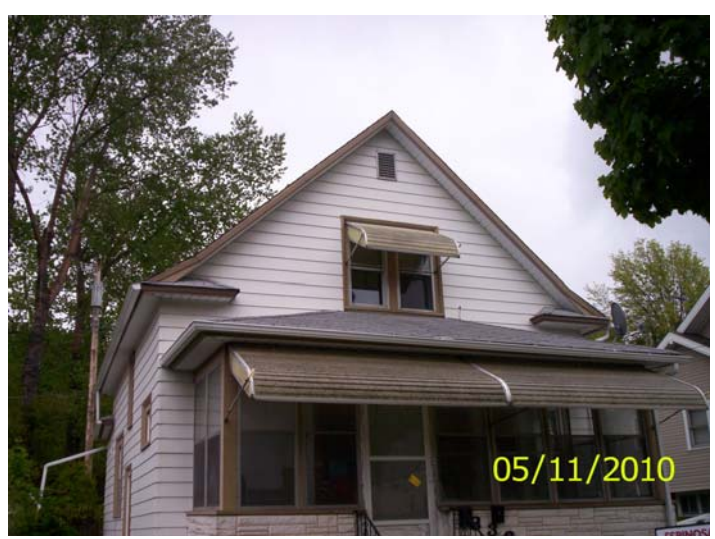
North and west sides