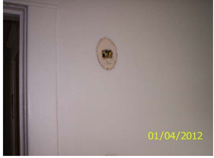
Missing fixture, open electric, exposed wiring