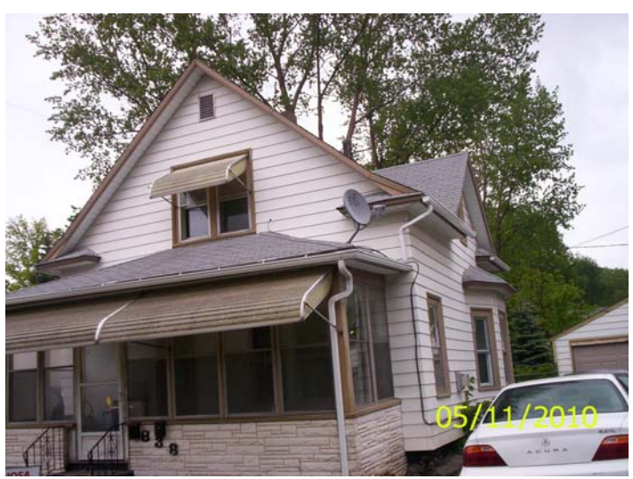
West and south sides