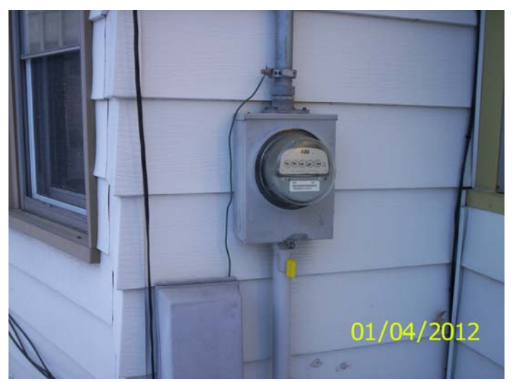
Electric service yellow tagged off