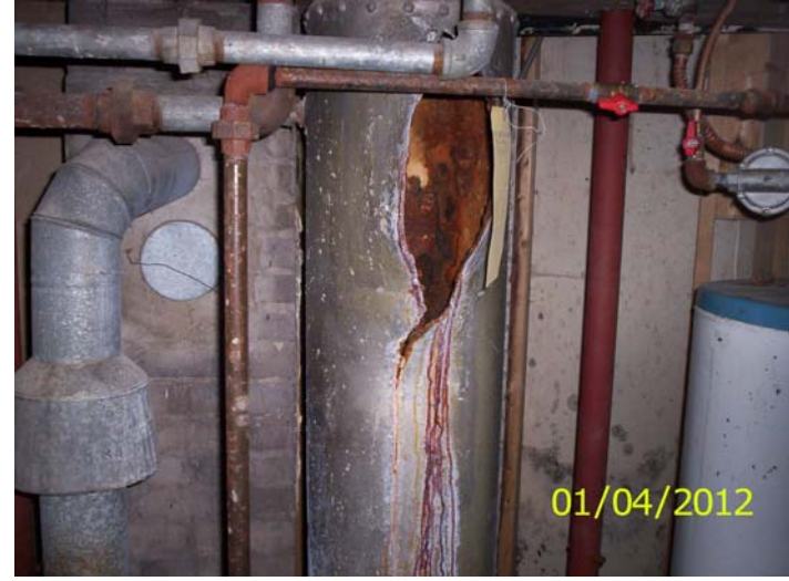
Burst expansion tank for the hot water heating system