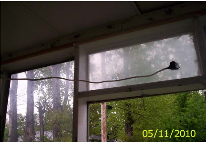
Unapproved electrical wiring on rear porch

May 11, 2010 10 - 319910 Date: File #: 838 ROBERT ST S Folder Name: PIN: 082822340104