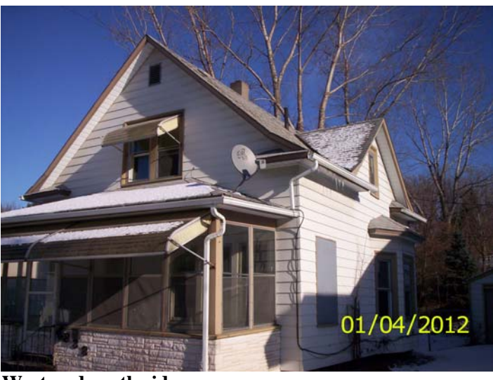
West and south side