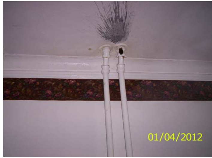
Blown out hot water heating line