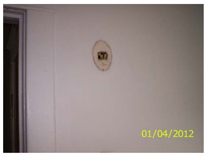
Missing cover plate, exposed wiring