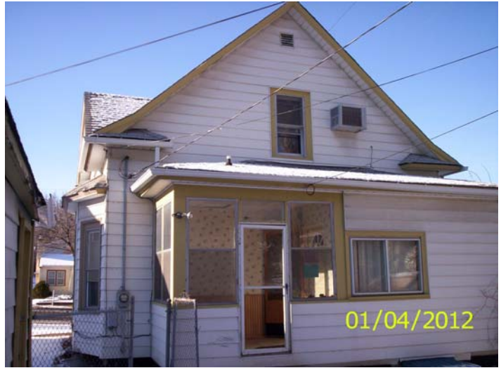
South and east sides