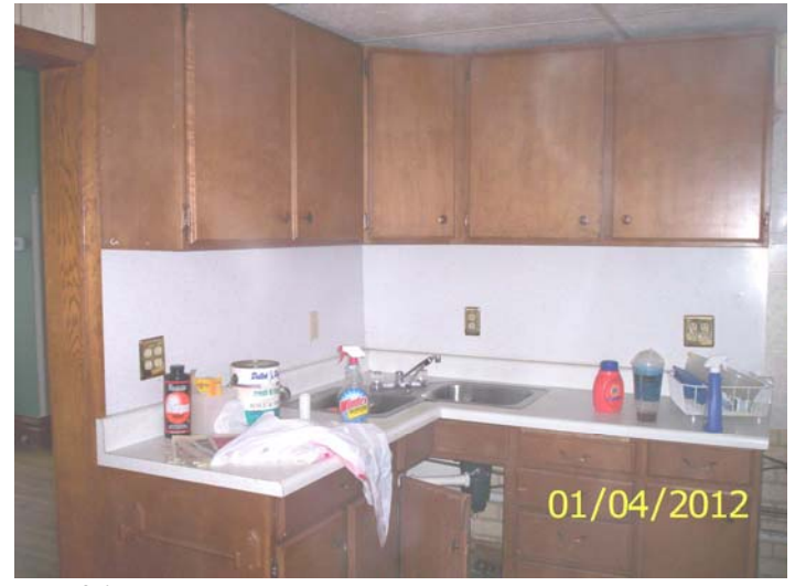
No gfci protected outlets