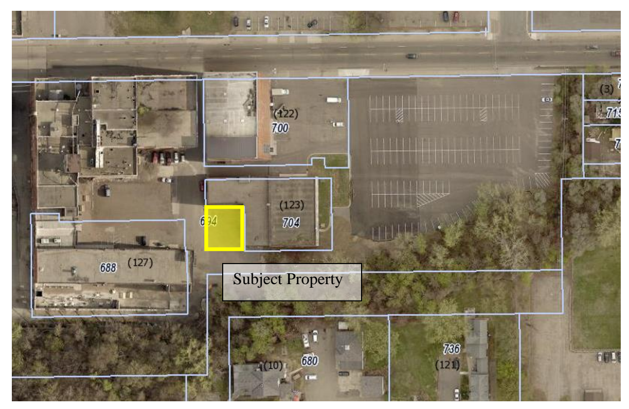
Subject Property, as highlighted in YELLOW. Subject Property includes a 60' by 50' area to the southwest of the 11 Wells Parcel, 704 Minnehaha Ave.