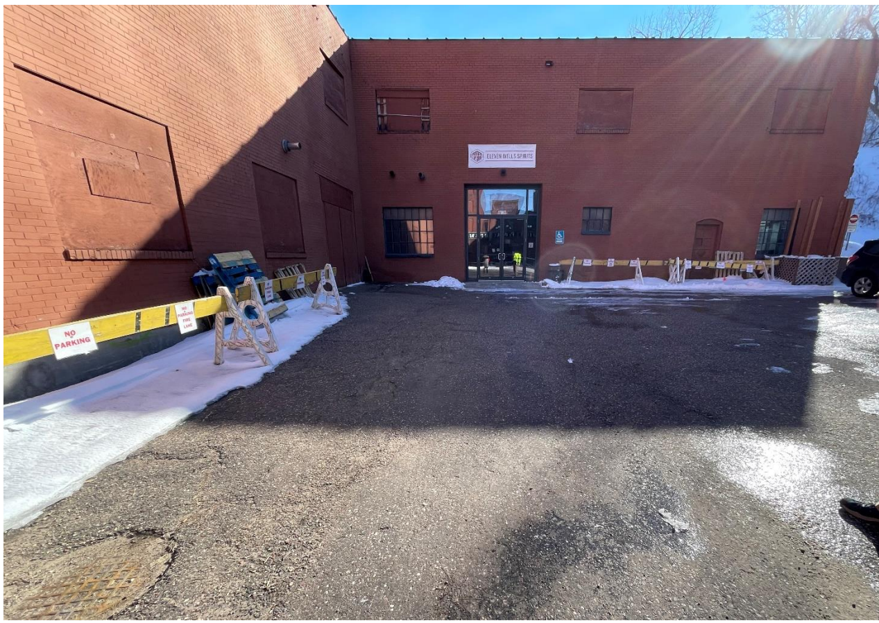
Subject Property, photo taken facing east.