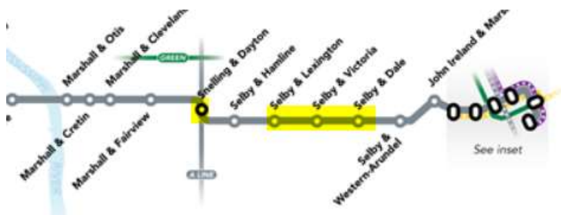
B Line stations