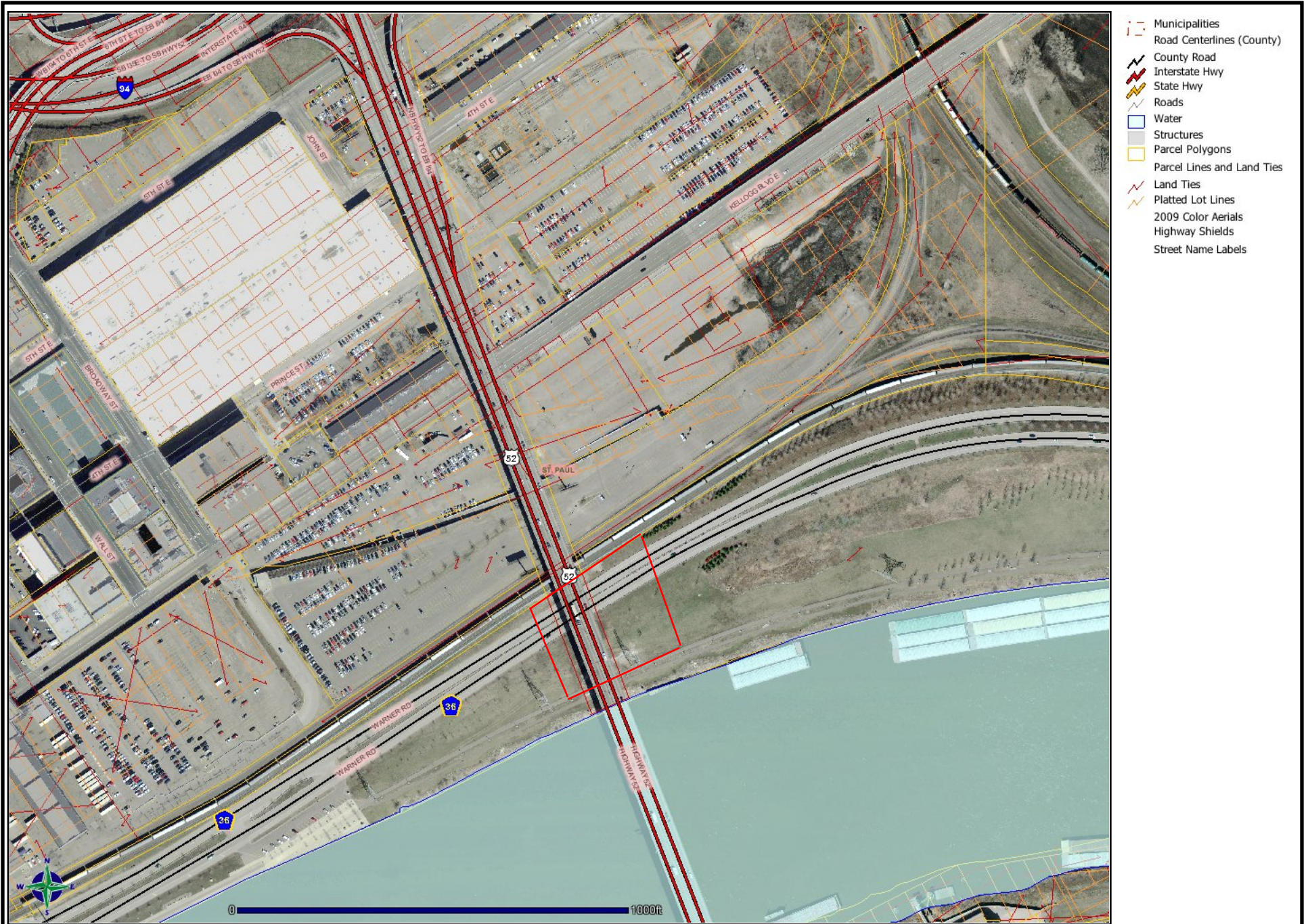
Exhibit A - Lafayette and Warner Road Temporary and Permanent Easement Area

DISCLAIMER: This map is neither a legally recorded map nor a survey and is not intended to be used as one. This map is a compilation of records, information and data located in various city, county, state and federal offices and other sources regarding the area shown, and is to be used for reference purposes only.