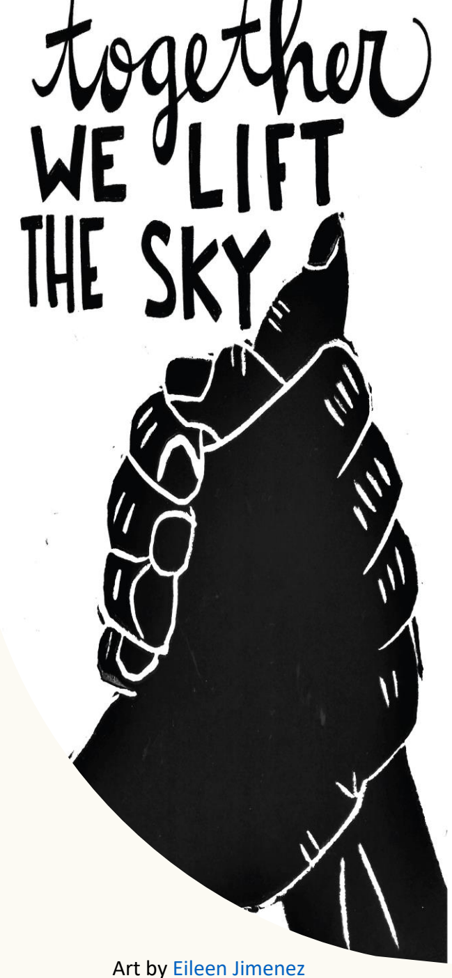
Art by <u>Eileen Jimenez</u>

<u>Urban Institute</u> supports the covid-19 recovery strategy.