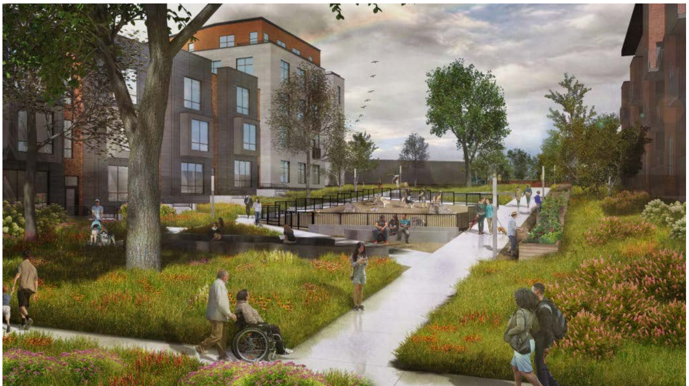
In keeping with the proposed Hillcrest Master Plan, this rendering shows how passive green spaces could fit between residential areas to enhance community connections.

Converting a commercial golf course into a publicly managed green space is not feasible from a budgetary standpoint. The city's parks department has neither the capacity nor the resources to manage more than a five-acre active park. In addition, the financial impact to maintain more than that would put a significant burden on residential taxpayers. With that said, the Port Authority will work with the community to maximize the potential of an additional 15-acres of publicly accessible green space as previously agreed upon.